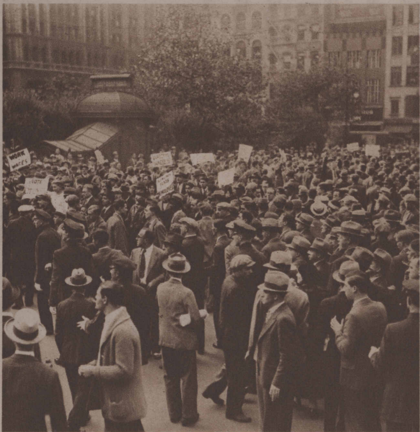
THE END OF A "HUNGER MARCH" IN NEW YORK —Communists and spectators outside the city hall during the radical demonstration which had a climax of violence in two riots.