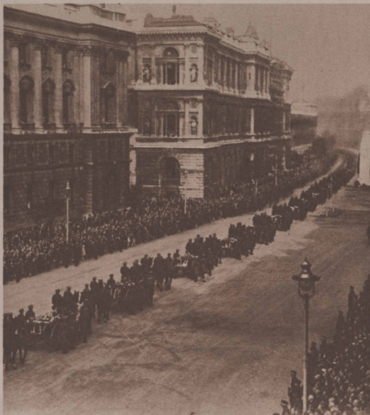
BRITAIN MOURNS DEAD OF R-101 —Silent multitudes bare their heads as caissons bearing bodies of forty-eight victims roll through London.