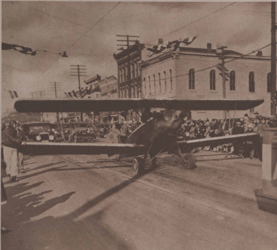
THE AERIAL AGE CROWNS A CENTENNIAL PAGEANT —Taxiing down the main street, a plane gives a novel fillip to the celebration of a hundred years of history at Lockport, Illinois.