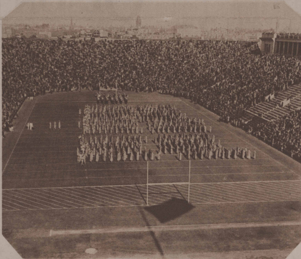
THE ARMY INVADERS THE HARVARD BOWL , emerging with the loot of a football victory, 6 to 0. This parade of cadets in gray was a ceremonial preliminary to the principal business of the day.