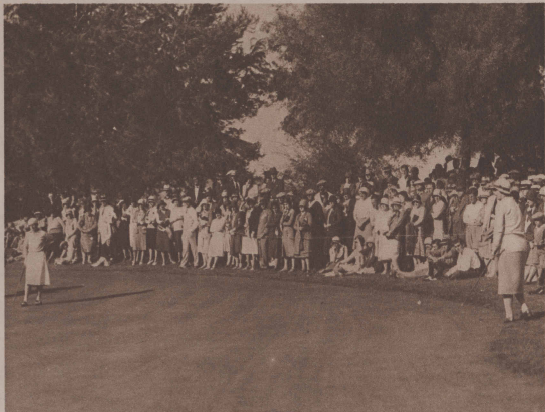
"THE WONDER GIRL OF GOLF" CAPTURES ANOTHER CROWN —Glenna Collett making the last putt of the match in which she annexed her fifth national women's title at Los Angeles. Virginia Van Wie of Chicago, losing finalist, is at left.