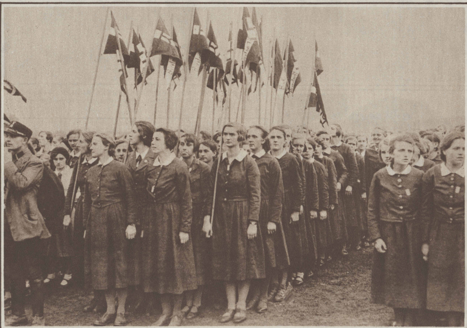
TWO PICTURES FROM GERMANY—Girl followers of the Nazi leader, Adolf Hitler, hear his address at Potsdam. At the right the aged Reichspresident von Hindenburg receives a bouquet from a youthful Berlin admirer in celebration of his 85th birthday.