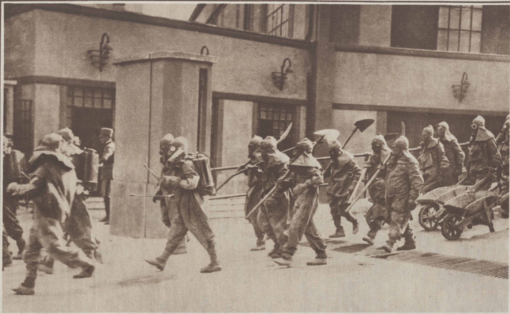
EQUIPPED WITH GAS MASKS, PICKS, AND SHOVELS, Roman citizens participate in anti-gas drills, whose purpose is to prepare the populace against possible gas attack in war.