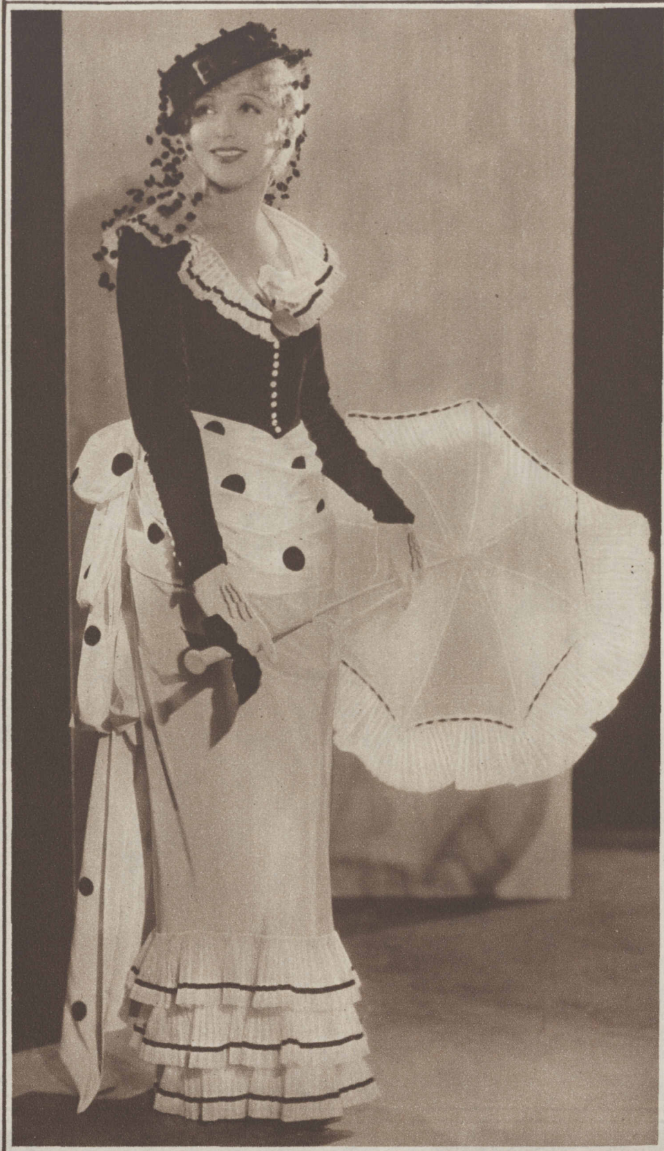
AS A BEAUTY OF GOLD-RUSH DAYS—Bebe Daniels in a historical screen play.