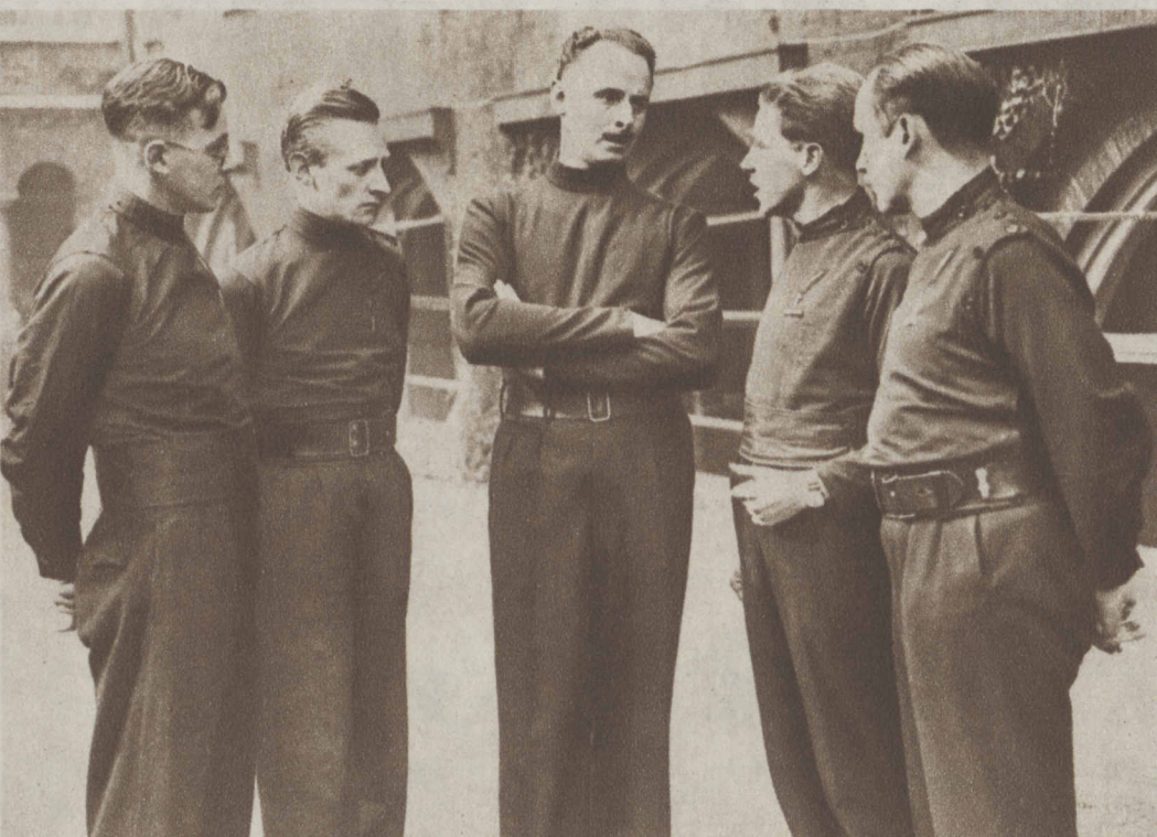
SIR OSWALD MOSLEY, leader of the British fascists, and who inherited a large fortune from his wife, granddaughter of the late Levi Leiter of Chicago, with four of his black-shirted followers at London headquarters.