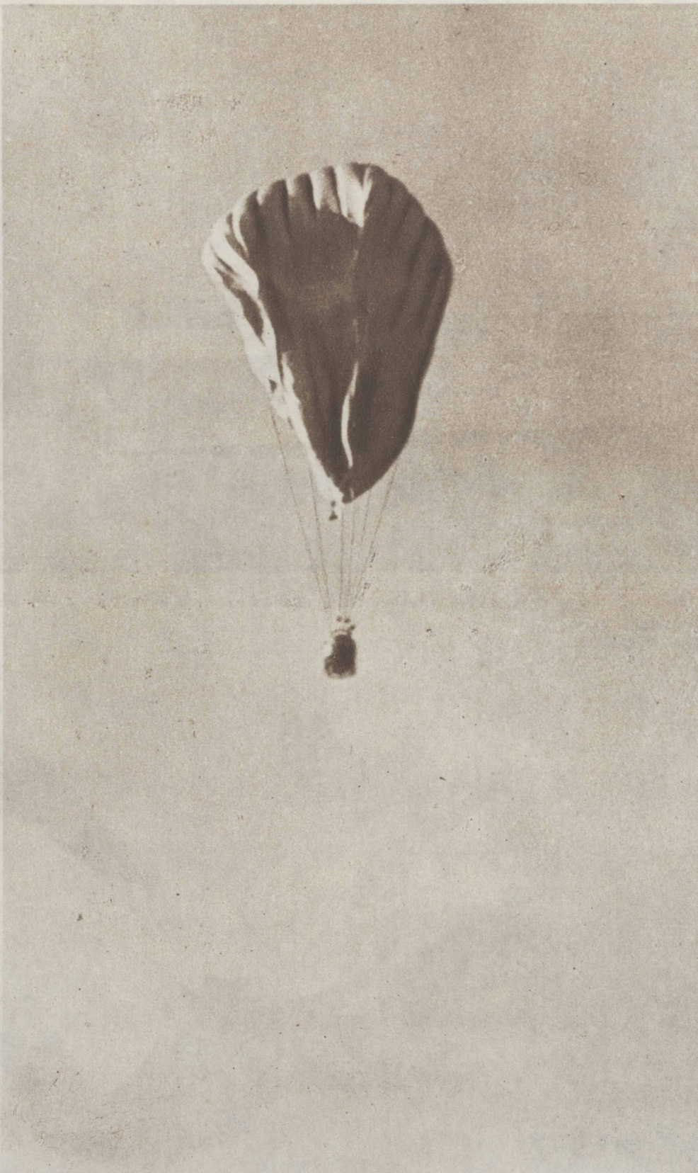
THE RUSSIAN STRATOSPHERE BALLOON "USSR" over Moscow during its ascension which established a record of eleven and eight-tenths miles.