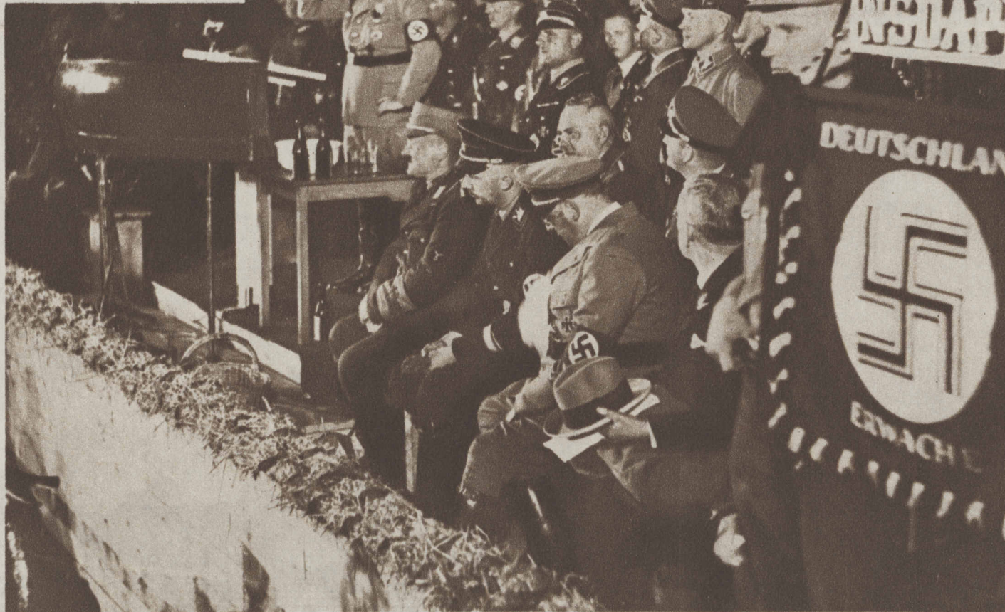
TWO PICTURES OF HITLER—At the left, a baby picture of the future nazi leader before he attained the age of one year; at right, the chancellor addressing 500,000 farmers and storm troopers at Bueckeberg.