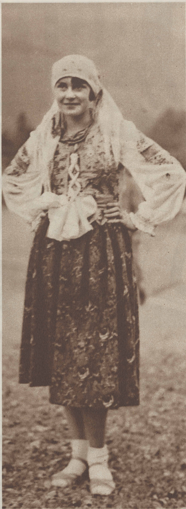
A DANCING BEAUTY OF POLAND.

AMBRÖSIA: the one-minute facial. 75¢ at all drug and department stores. Trial size at 10¢ stores.