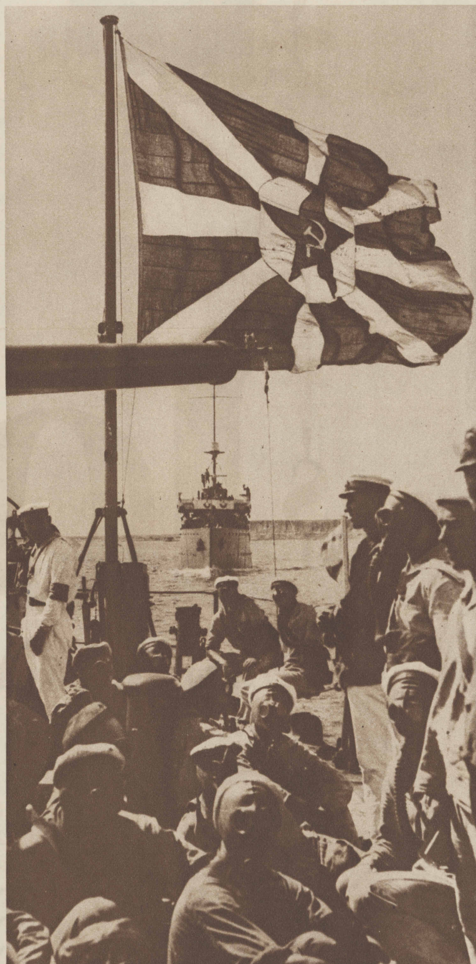
THE RED NAVY GOES TO SEA IN MASKS —Rehearsing defense against the lethal attacks of chemical warfare, soviet Russian sailors present a grotesque appearance during battle maneuvers. The ships, flying the hammer and sickle, are units of the soviet's eastern fleet.