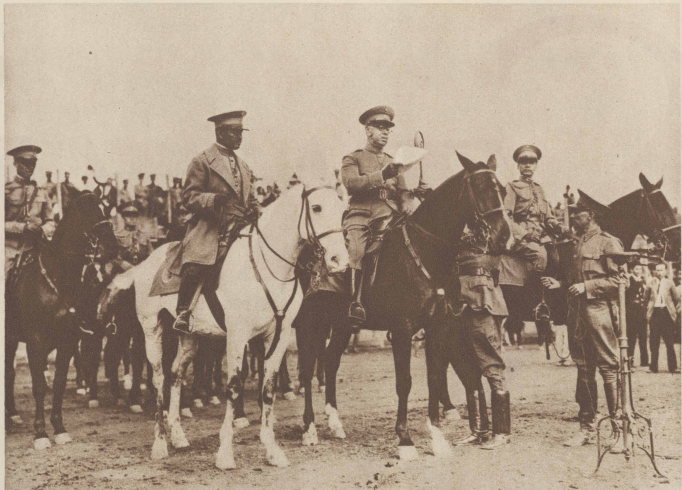
MEXICO'S CHIEF EXECUTIVE REVIEWS HIS TROOPS —President Pascual Ortiz Rubio delivers an address, during Mexican independence celebrations, before the greatest formation of military units ever seen in Mexico. Gen. Miguel Acosta, commander of the army, is at the president's left.