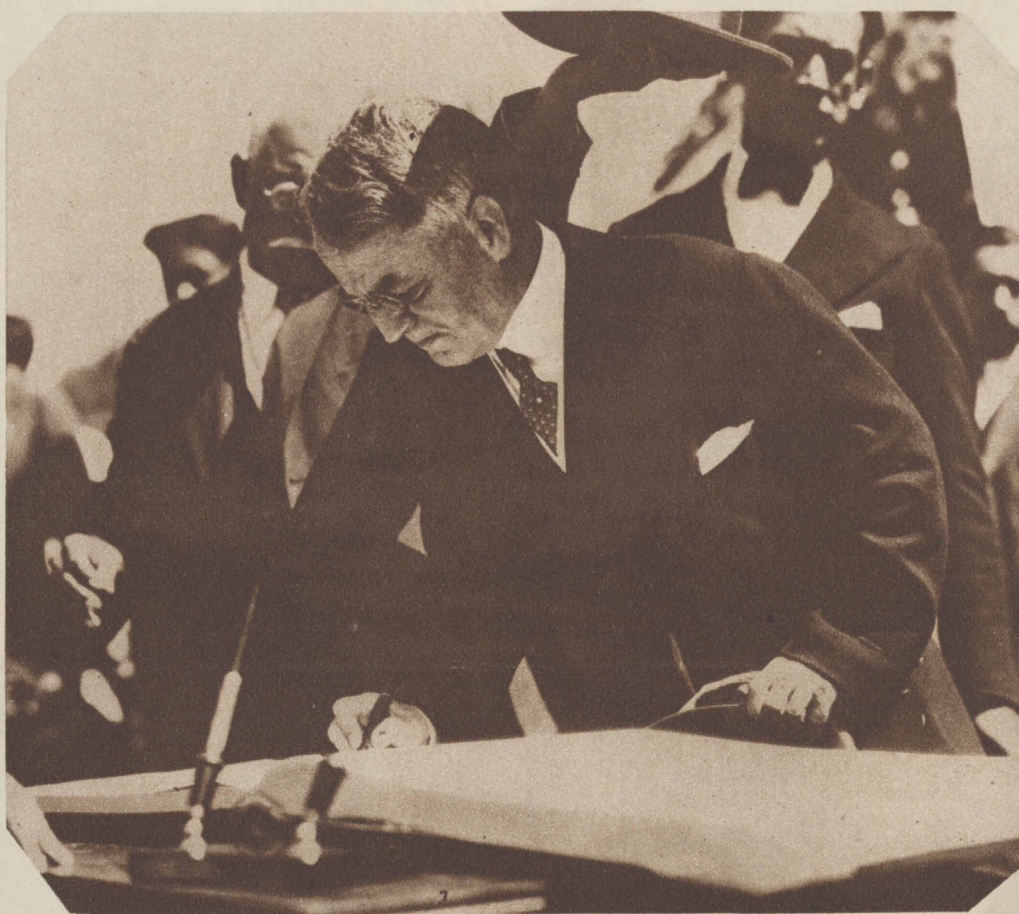
THE AMBASSADOR'S LAST OFFICIAL ACT —Dwight Morrow, America's retiring envoy to Mexico, signing his name in a memorial book during the Mexican independence celebration. He has since returned to the United States to wage his New Jersey senatorial campaign.