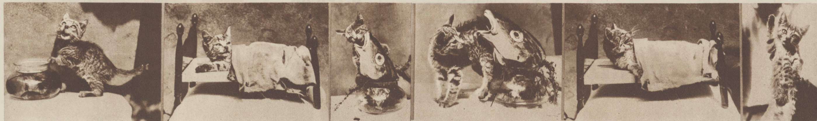
Tabette's Dream: A six-reel thriller of feline life REEL I. Dissipation. REEL II. Relaxation. REEL III. Hallucination (nightmare). REEL IV. Retaliation. REEL V. Realization. REEL VI. Renunciation.