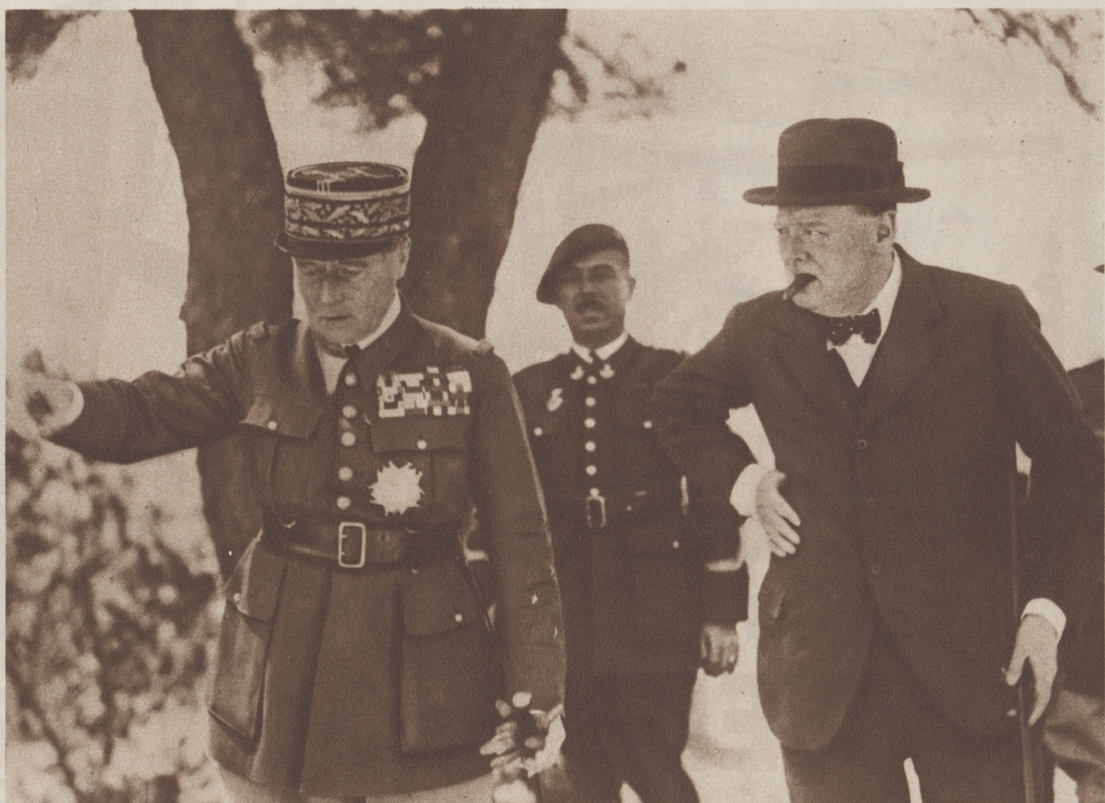
THE HEAD OF A BRITISH FAMILY IN THE NEWS SPOTLIGHT — Winston Churchill (right) with General Gamelin at French army maneuvers.