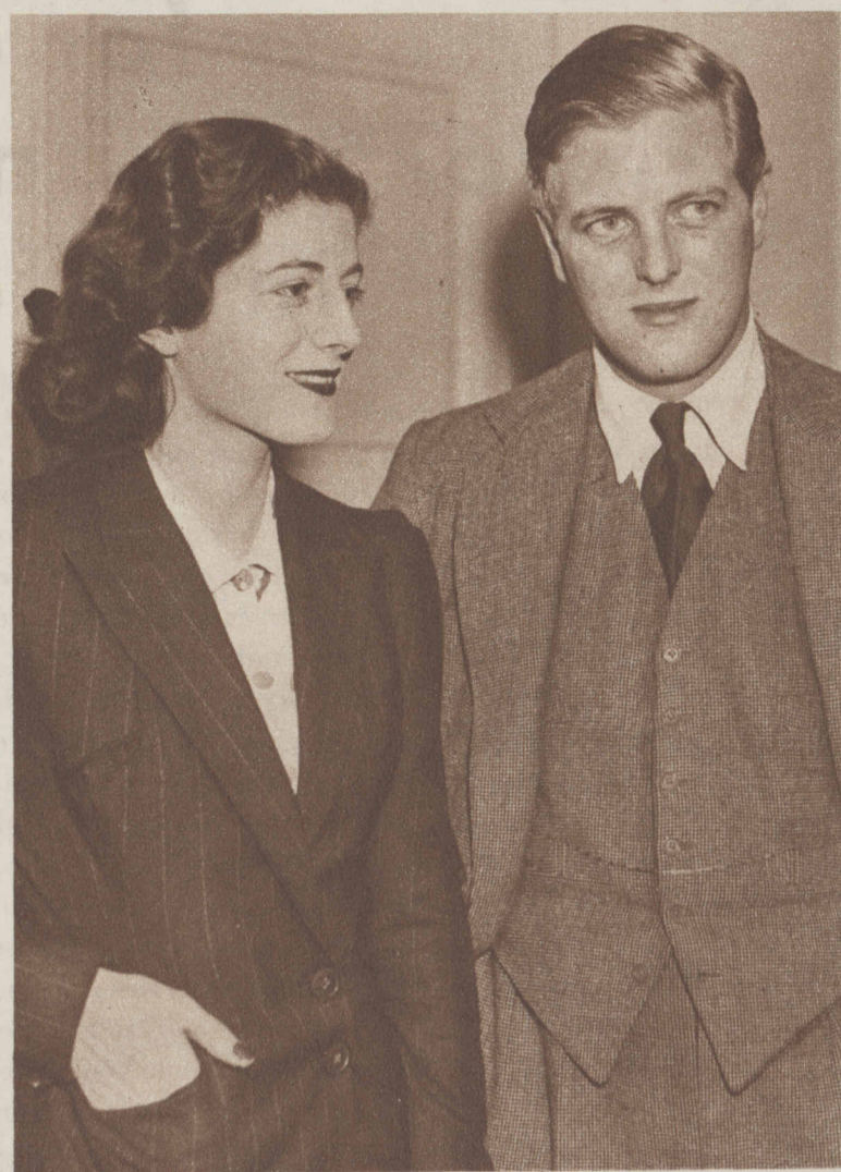
MAKING THE HEADLINES — Sarah Churchill, daughter of Winston Churchill, at New York with her brother, Randolph, who followed his sister across the sea to "discuss" her reported engagement to Vic Oliver, stage comedian.

MADE BY THE FORMFIT COMPANY · CHICAGO · NEW YORK