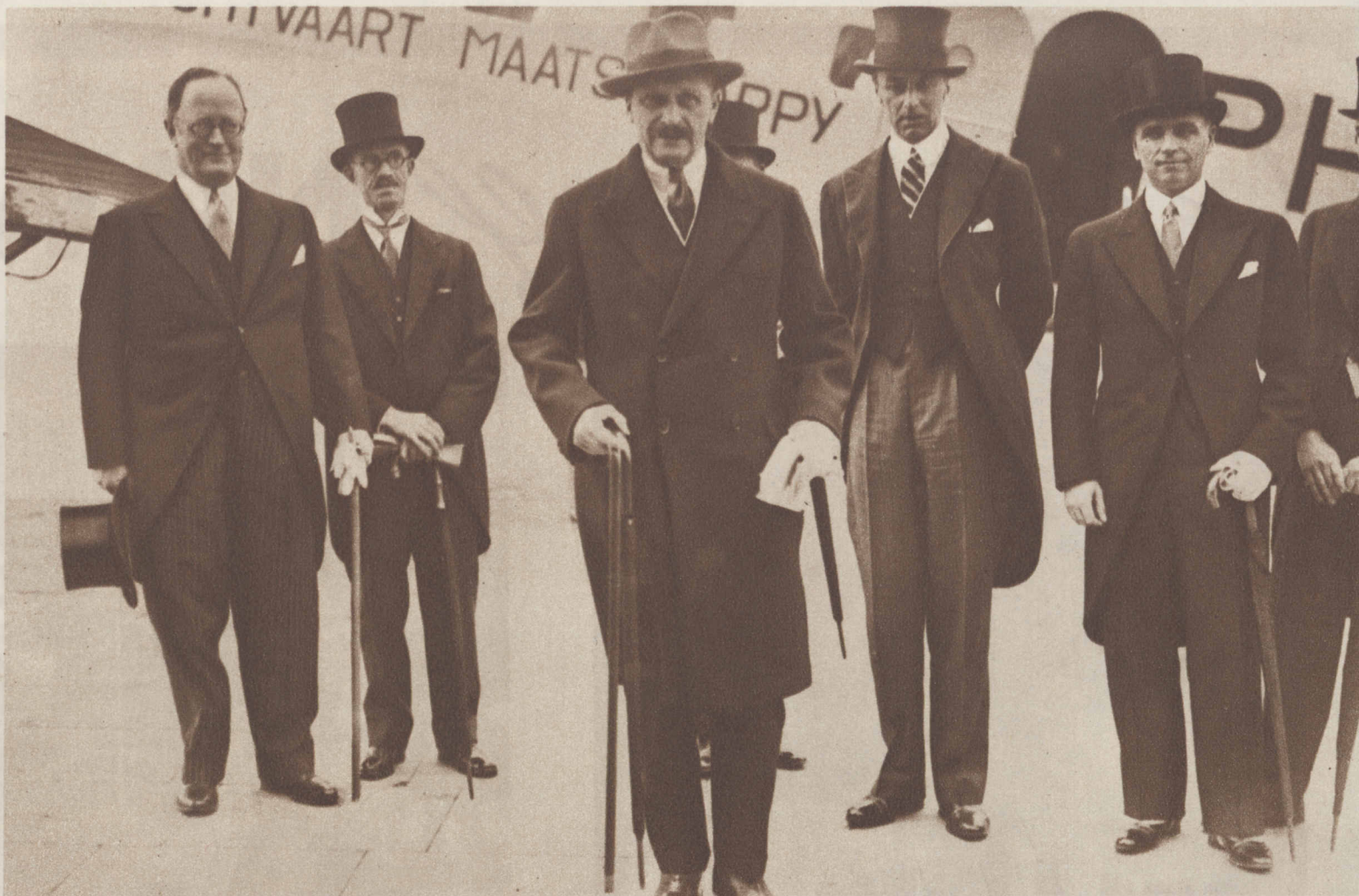
FINLAND'S "LIBERATOR" STUDIES ENGLISH DEFENSE METHODS—Field Marshal Mannerheim, chairman of the Finnish council of national defense, at Croydon airport.

Out of Town Residents—Send your mail orders to the Main Kitchen—357 North Central Park Ave., Chicago. Add 5c a lb. to cover postage and special packing.