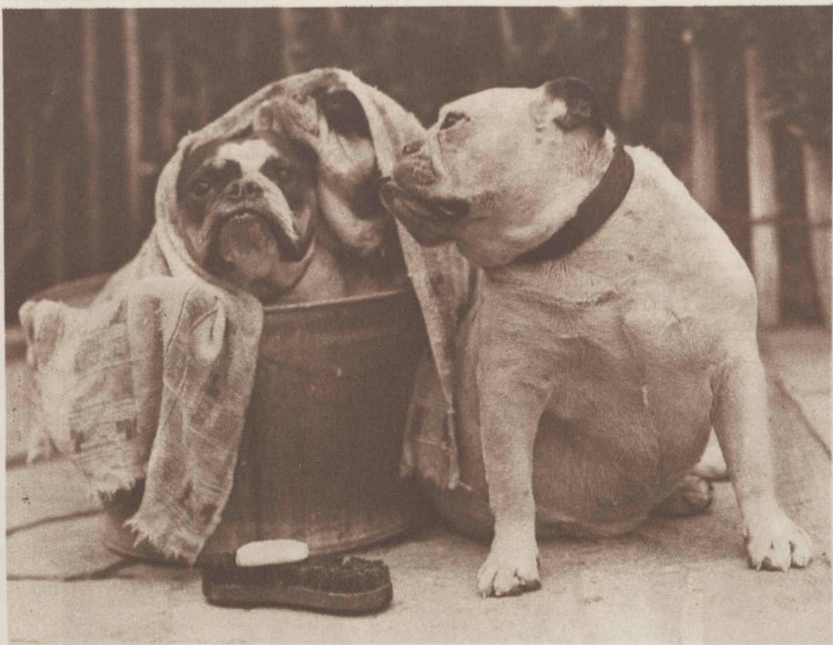
AFTER THE BATH—An English bulldog keeps watch over her young.