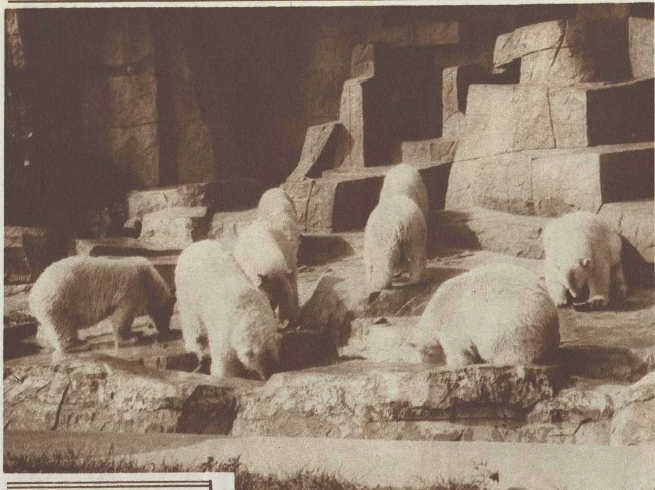
POLAR BEARS AT THE ZOO AT BROOKFIELD.