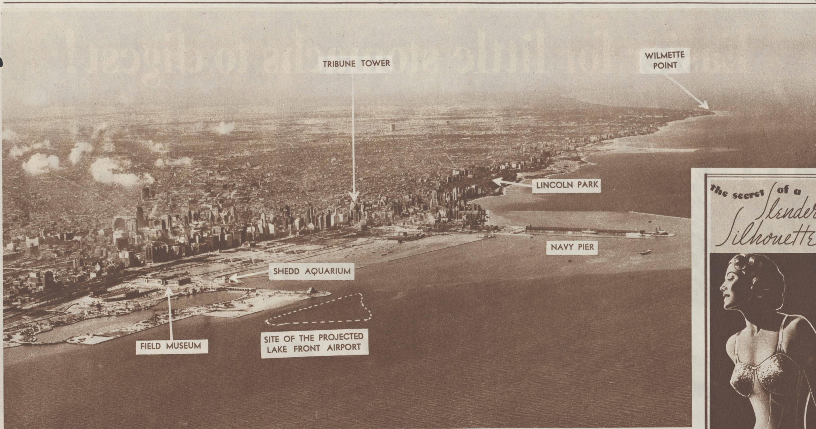
THE LAKE FRONT FROM THE AIR—A new panoramic vista of Chicago.