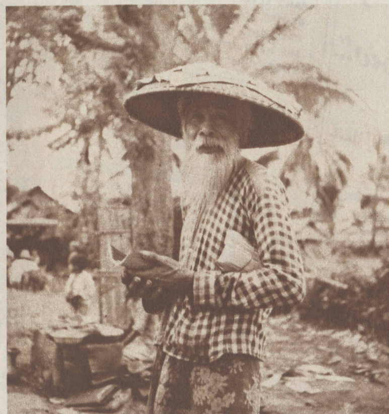
BALI TEMPLE GUARDIAN LUNCHES FROM A BANANA LEAF

"I couldn't believe that Tangee ended that powdery look...until I tried it!"