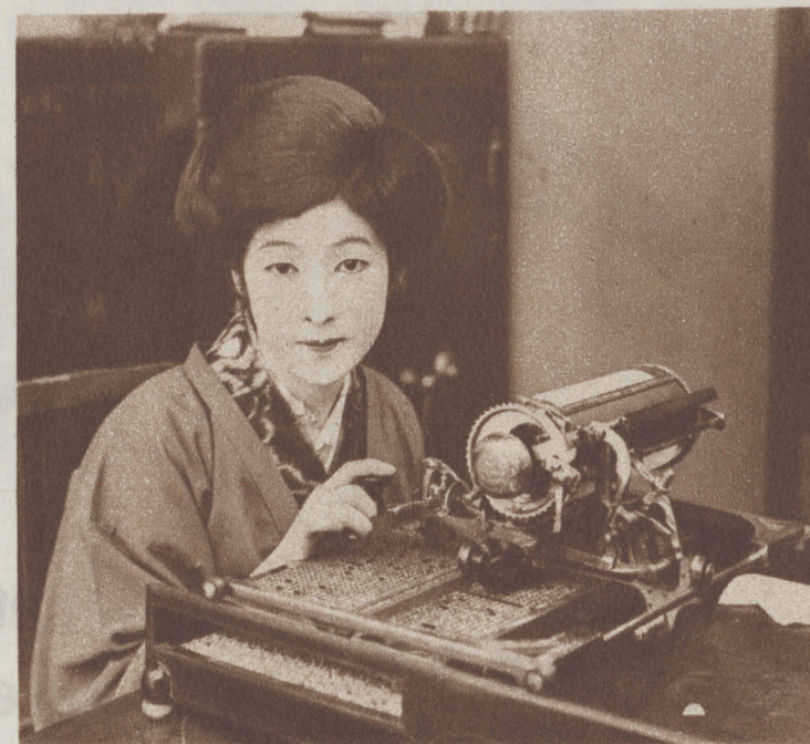
A TYPIST WITH A BRAIN-TRYING JOB—On the typewriter operated by this Japanese stenographer are more than a thousand characters.

THE NEW TANGEE FACE POWDER THE GEORGE W. LUPT CO. NEW YORK CITY