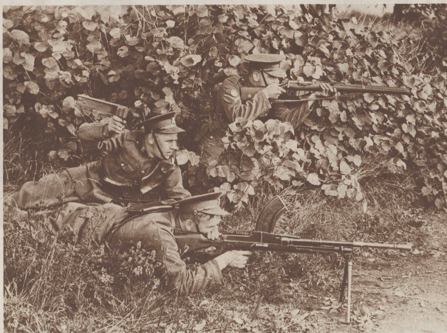
ENGLISH TROOPS TRY OUT A NEW WEAPON—An infantryman armed with the Bren machine rifle in maneuvers.