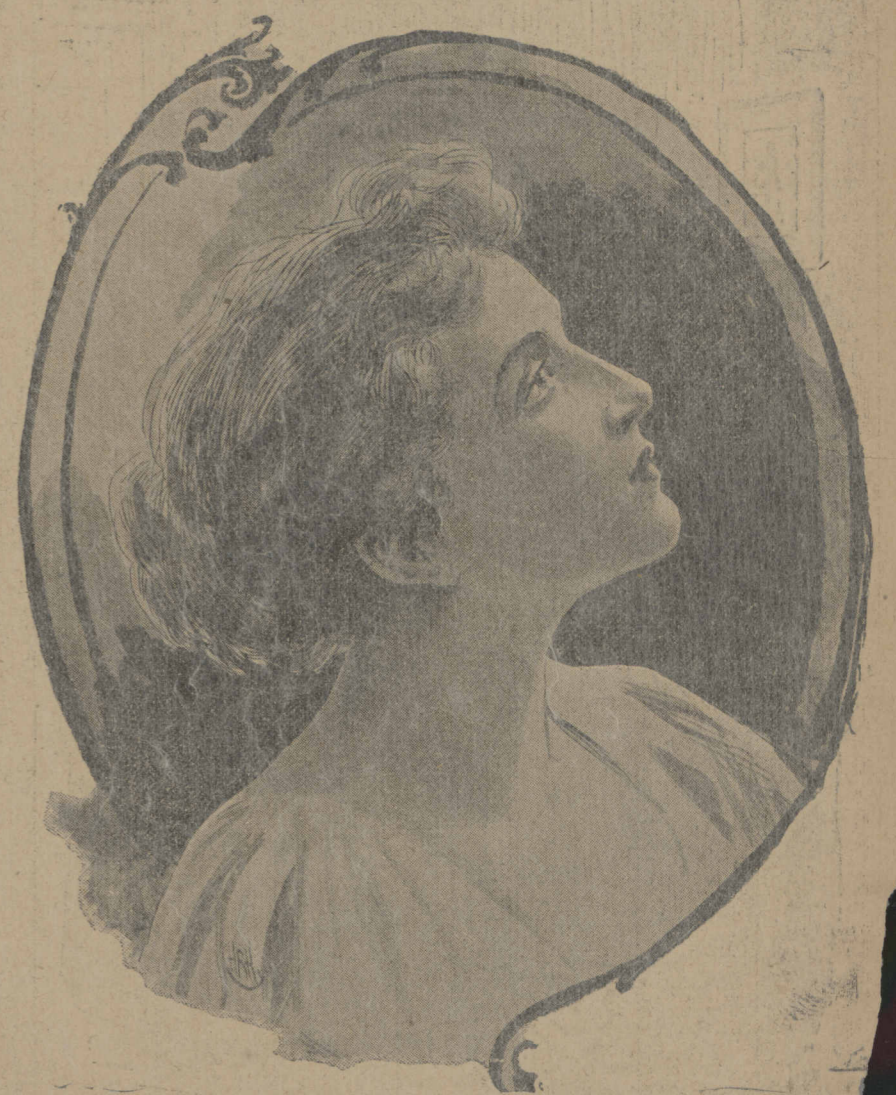
She Is Probably America's Richest Heiress.

Uses English Language. The King of Greece, when conversing with the members of his family, never employs any but the English language. He seldom speaks French, and only uses Greek when compelled to do so.