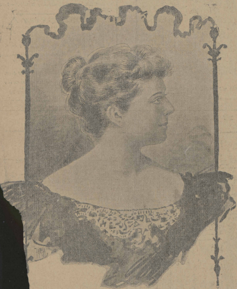
Was the Most Beautiful Woman at Bar Harbor This Summer.

Regret. exclaimed one sugar trust "matter?" asked his friend, dollars are being brought like region." make any especial difference