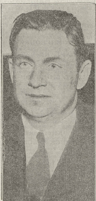
ADMITS FATAL BLOW.