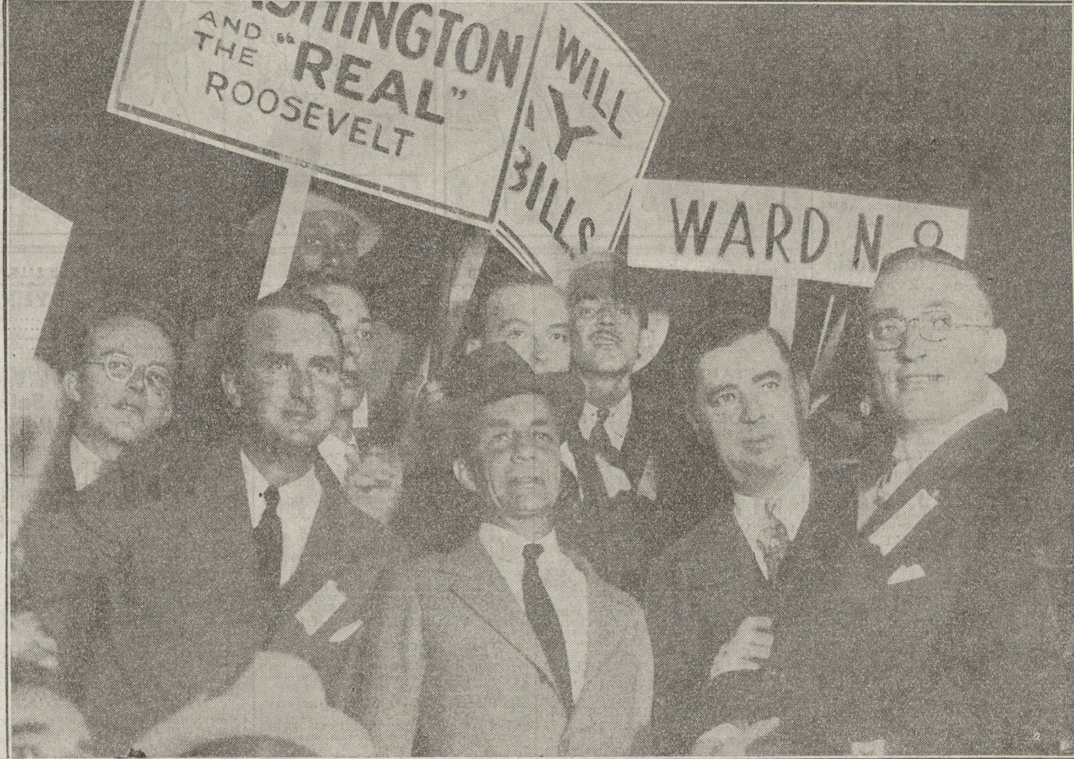
THRONG OF YOUNG REPUBLICANS WELCOMES THEODORE ROOSEVELT IN TORCHLIGHT PROCESSION.