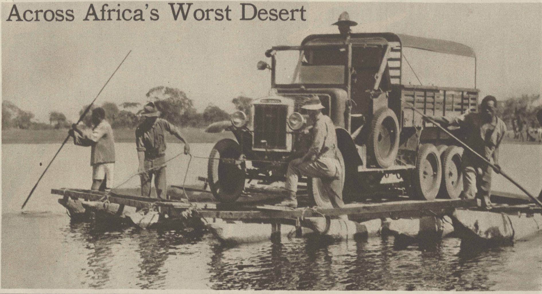
ONE BIG RIVER TO CROSS— After leaving the desert, near the western termination of the journey, the two trucks of the expedition were ferried by natives across a stream with a dense population of crocodiles and hippos. Canoes lashed together formed the ferry.