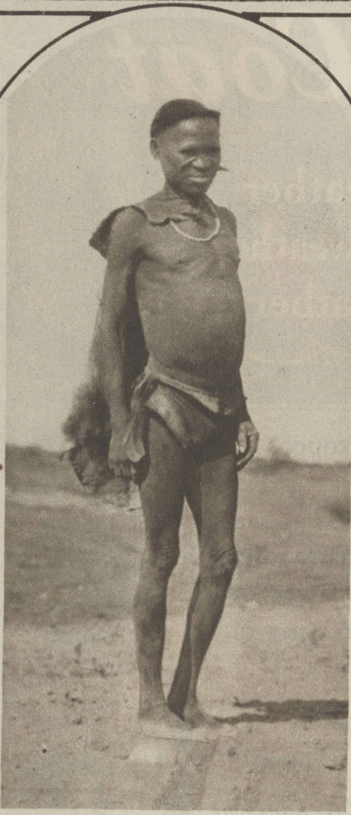
MAN FRIDAY— A leather-skinned bushman nomad of the desert. He and the elephants have one thing in common—wrinkled hide. He carries water in an ostrich egg shell, which is partly buried in the sand at his feet.