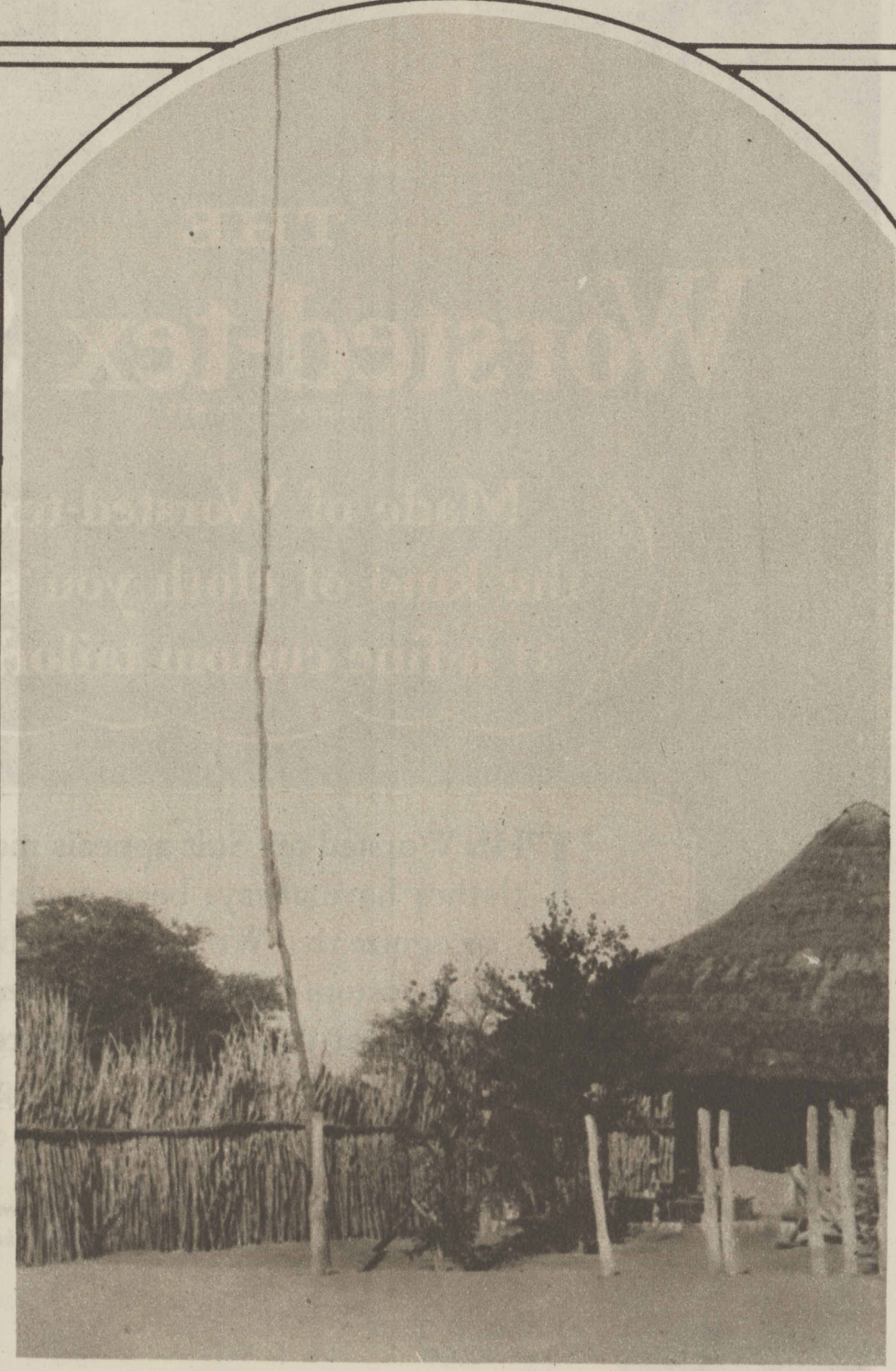
LISTENING IN ON THE WORLD— After traversing the desert the explorers came upon a trader who, with a radio set, keeps this hut in the bush in constant touch with the civilized world. He was able to give his visitors up-to-the-minute news.