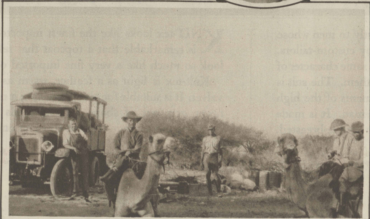
TODAY MEETS ANTIQUITY— The motorized Kalahari expedition encounters a camel patrol in the desert. When tortured by water famine, the explorers longed for trucks with the camel's famous gift. But a truck has to drink.