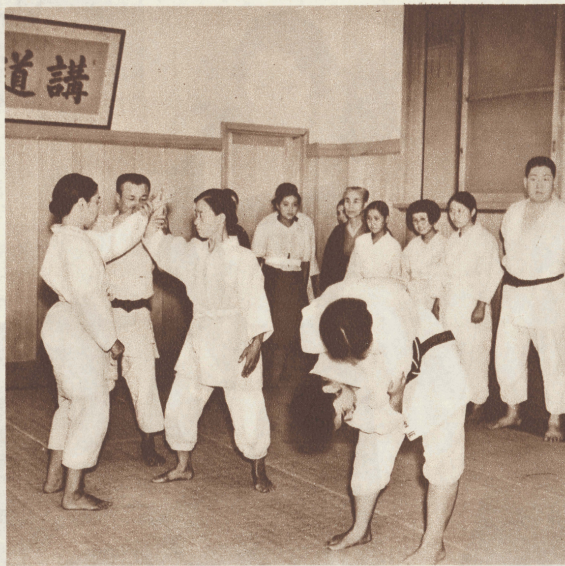
JAPANESE WOMEN GO IN FOR JIU-JITSU—A Tokio class learning the strenuous art. (Acme photo.)

FIRE DESTROYS A SEA-GOING GAMBLING HOUSE —The barge Casino burns off Long Beach, Cal., following explosion of a gasoline engine. (Acme photo.)