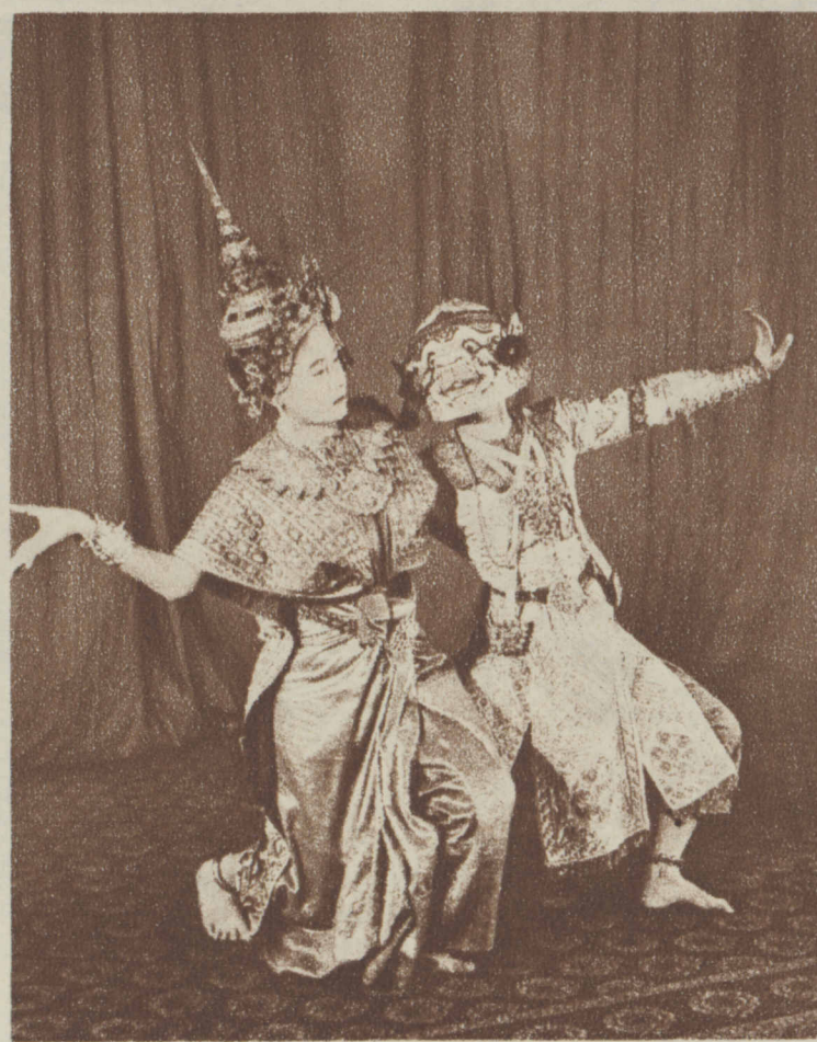
BANGKOK DANCE—Siamese temple performers in an interpretative pose.