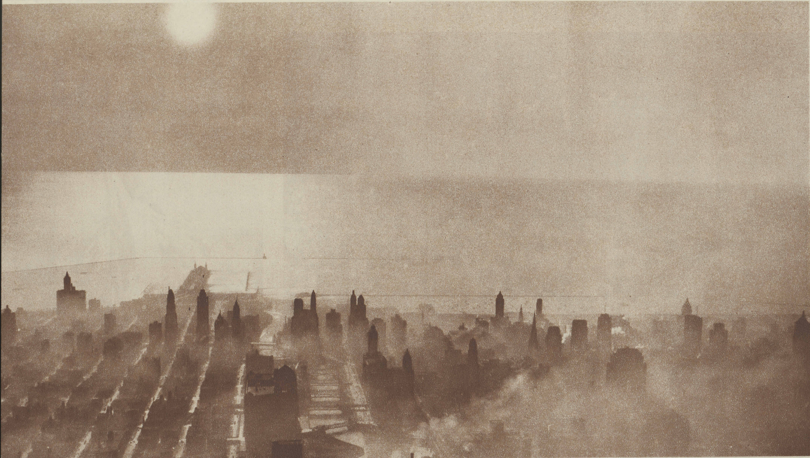
SUNRISE FOG OVER CHICAGO—An unusual air view of the downtown district.