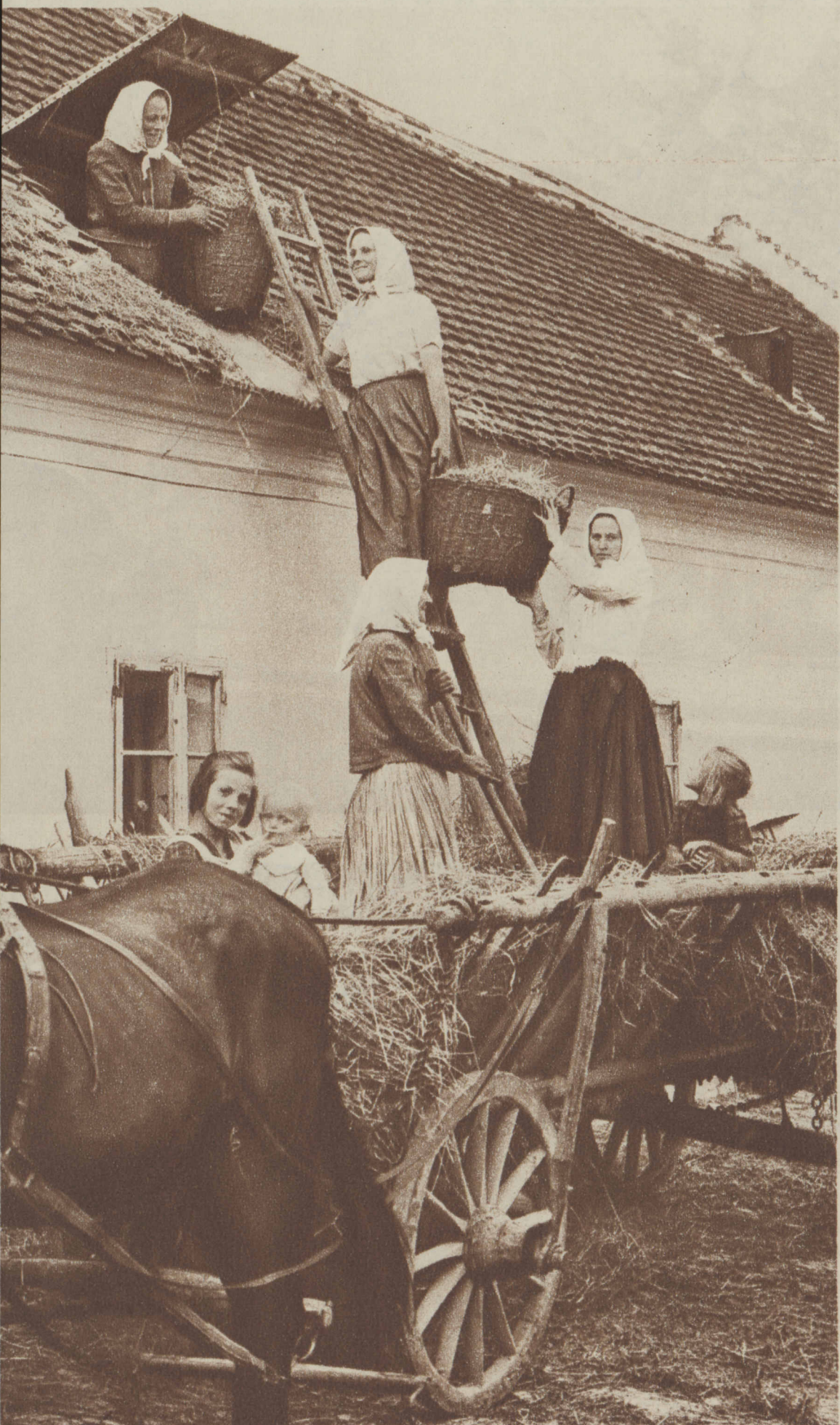
HAY MAKING TIME IN CZECHO-SLOVAKIA—Peasant women filling a mow which is an integral part of a farmhouse.