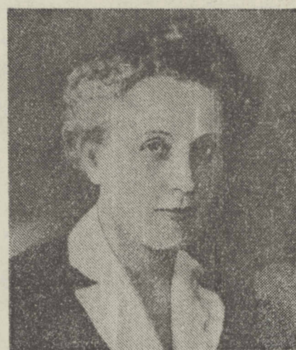
SIGRID SCHULTZ Chief of the Tribune Berlin Bureau