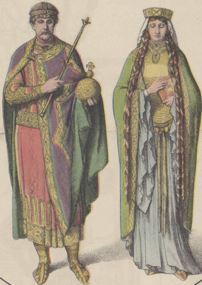
DRESS, headdress and ornaments of Frankish royalty in the eleventh century were what the fashions expert of today might, and might not, call chic. Witness the accompanying view of the king and queen.