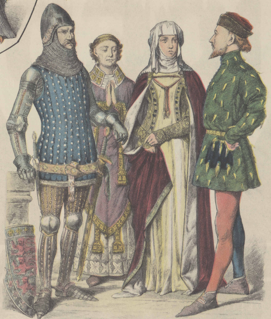
FASHIONS CHANGE WITH THE YEARS, and they have been doing it for a long time. Each of these four personages belonged to the fourteenth century, and each hailed from England, but there the similarity ends. The years represented are: 1365, 1330, 1350, and 1390.

(All drawings from "Zur Geschichte der Kostueme," published by Braun & Schneider, Munich.)