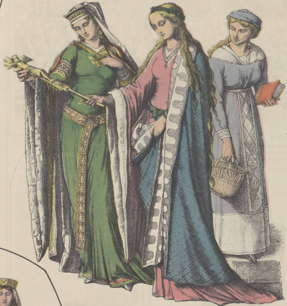
DISTINGUISHED GERMAN WOMEN of the twelfth century bowed, as always, to fashion's whims and, of course, thereby became the ill-concealed envy of their less fortunate sisters. Milady of 1929 would not be so envious.