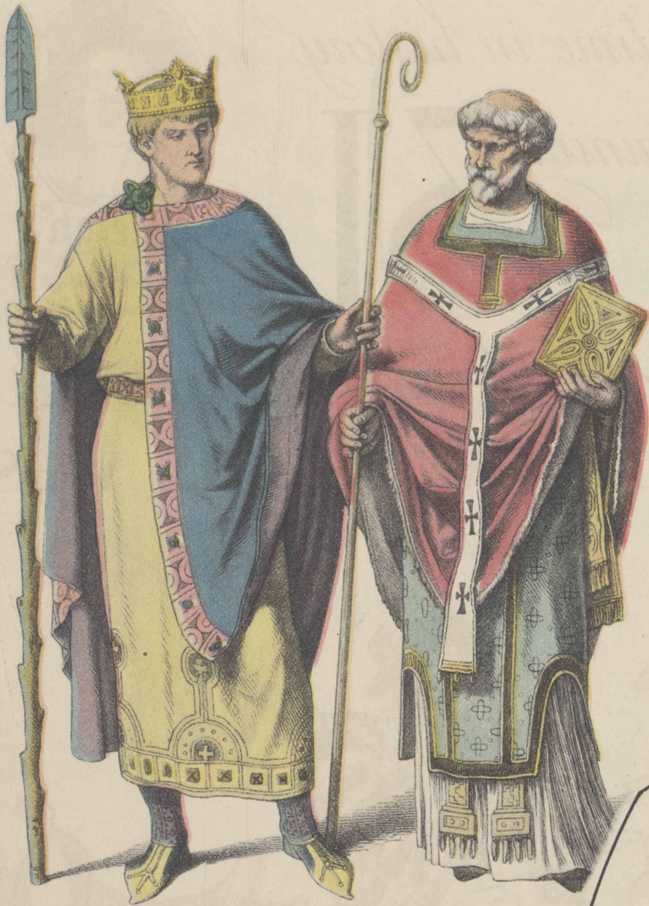
ONE THOUSAND YEARS AGO church and regal robes were of elegant hues. Kaiser Heinrich II. of Germany, whose reign ended in 1024, gives proof of that statement in this pose with a Frankish bishop. Installment III. of the pictorial history of costumes starts with the tenth century.