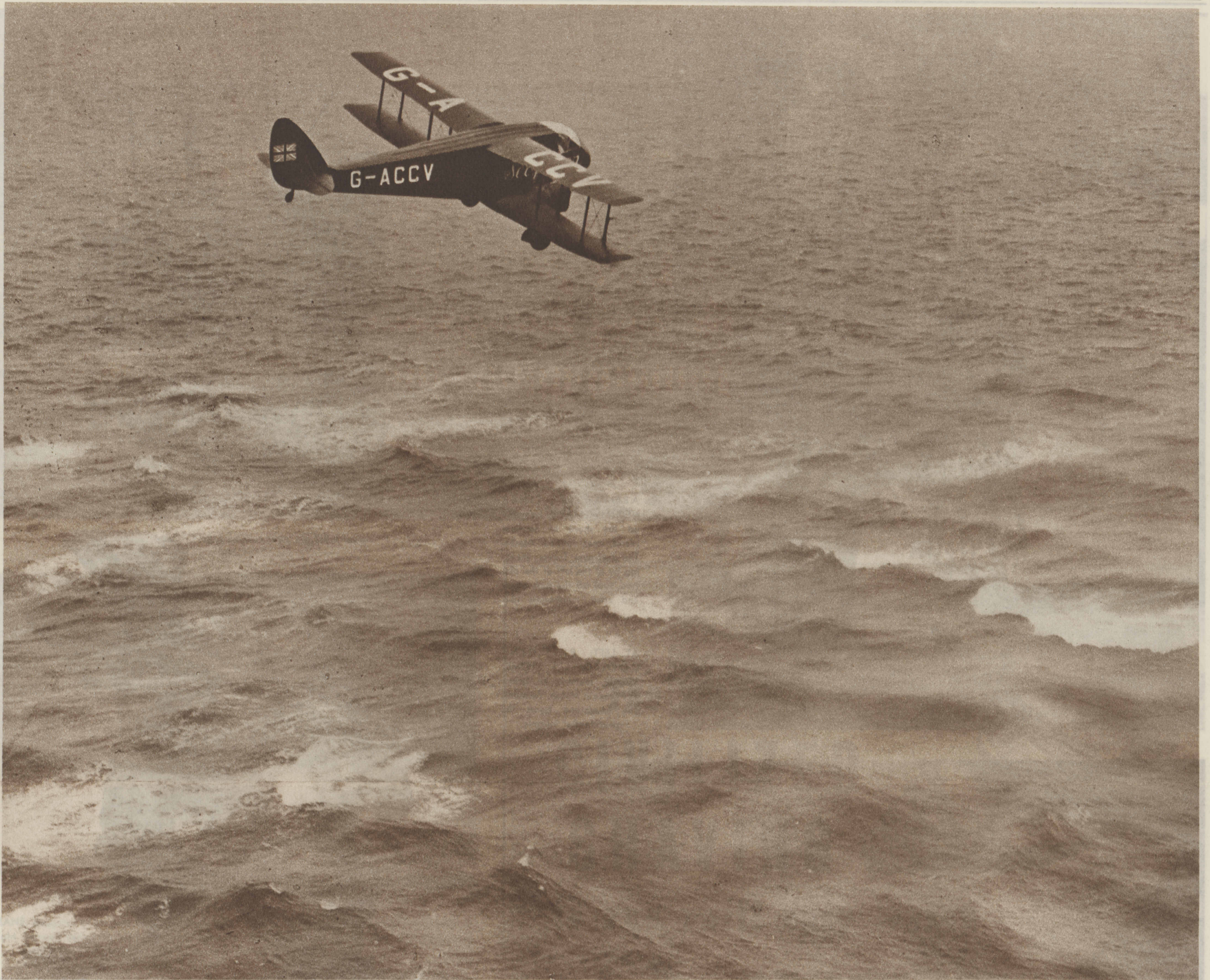
THE MOLLISONS' PLANE OVER THE ATLANTIC.