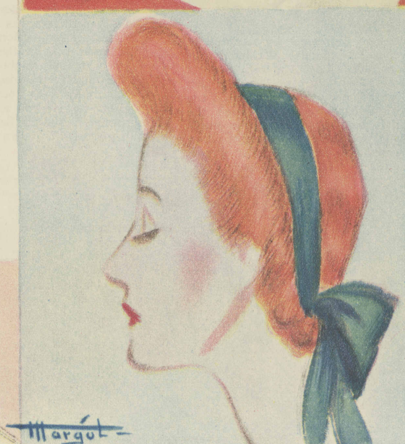
Exclusive drawings of original coiffures by Antonio of Paris that display his unusual arrangement of the smooth coil and the clever use of ribbon and flowers as ornamentation.