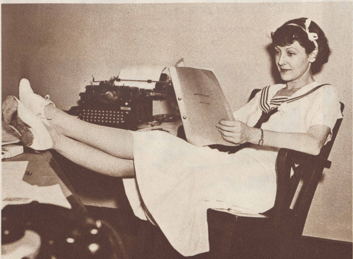
A STAR OF THE SILENT FILMS TURNS SCENARIST—Patsy Ruth Miller looking over one of her scripts.