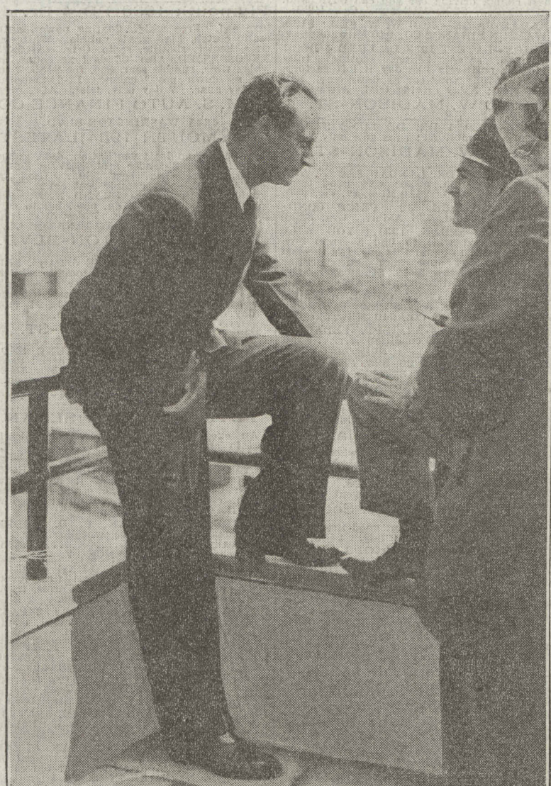
GRANDSON OF FORMER KAISER VISITS FAIR. Prince Louis Ferdinand, grandson of exiled German ruler, viewing the World Fair grounds from the Administration building after arrival yesterday. (Story on page 6.)