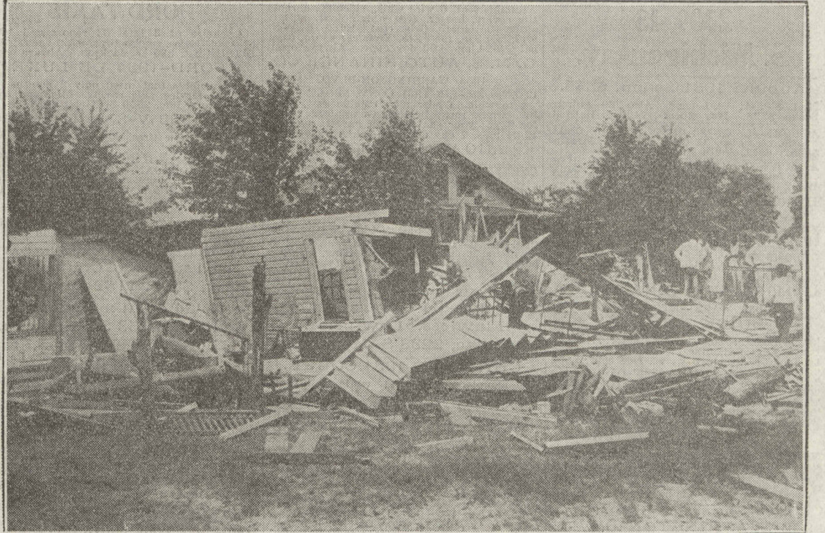
SIXTEEN DEAD IN WAKE OF SEVERE STORM; DAMAGE IN MILLIONS. One of homes wrecked by squalls at Hickory Point, Md., a summer colony near Baltimore. The storm swept several states, including Illinois, Ohio, and Michigan, eleven losing their lives in latter state. (Story on page 9.)