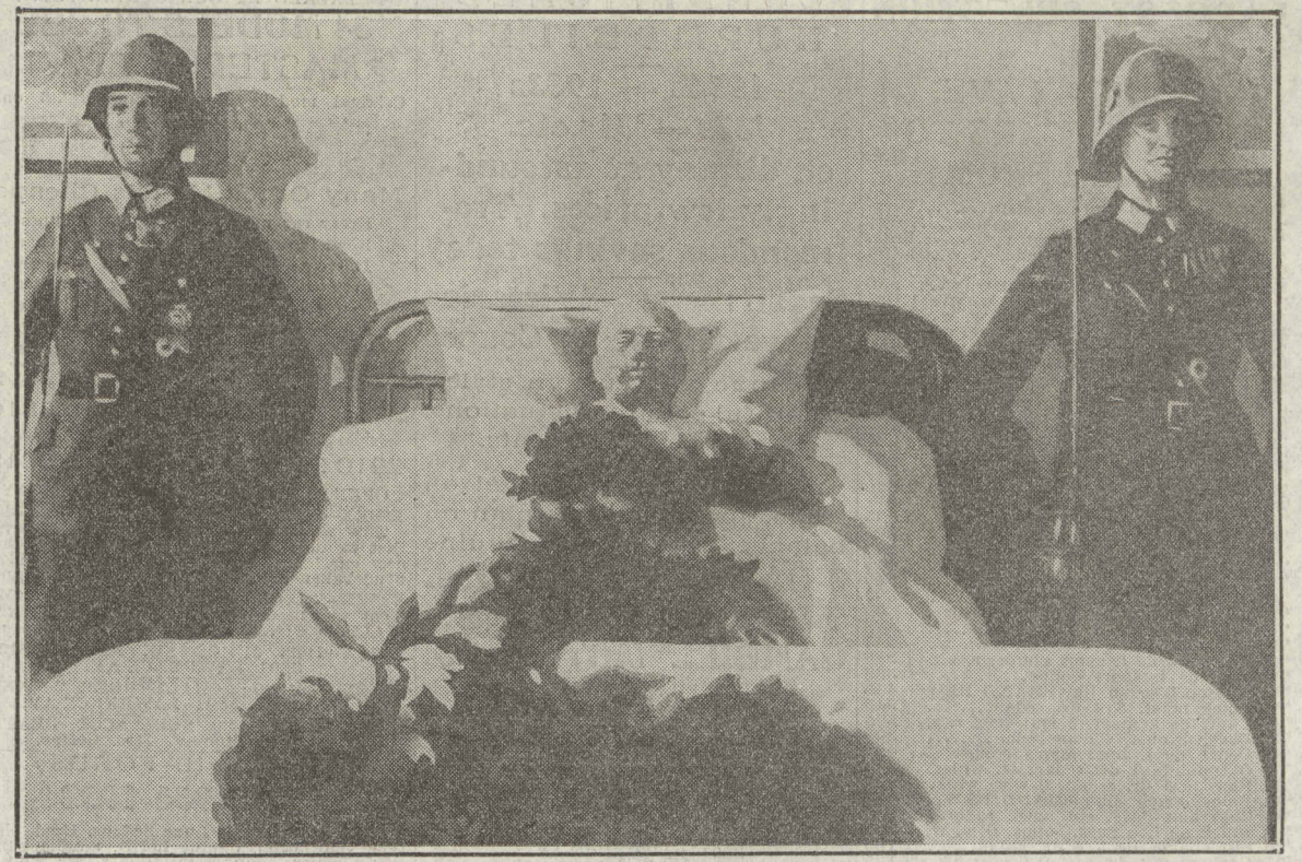
BODY OF HINDENBURG LIES IN STATE; THOUSANDS PAY LAST TRIBUTE. Two reichswehr officers standing at attention beside body of German president at Neudeck estate, where he died at age of 86 years. Thousands of mourners crowded the village yesterday to pay their last respects. (Story on page 1.)