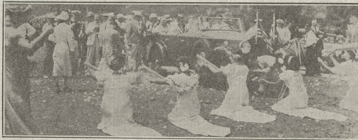
NATIVES OF HAWAII ENTERTAIN PRESIDENT WITH MUSIC AND DANCING. President Roosevelt (seated in car) is watching native girls dance the hula while on tour of Oahu Island. The hula is danced while kneeling as well as standing. President Roosevelt reached Portland yesterday. (Story on page 1.)