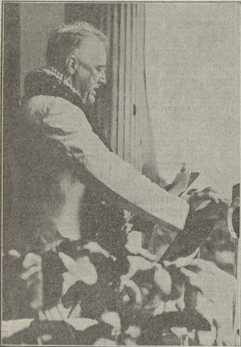
PRESIDENT RETURNS FROM CRUISE TO HAWAII. President Roosevelt, who landed yesterday at Portland, Ore., shown as he spoke from royal palace in Honolulu. He is bronzed from sea voyage and lei-bedecked. (Story on page 1.)