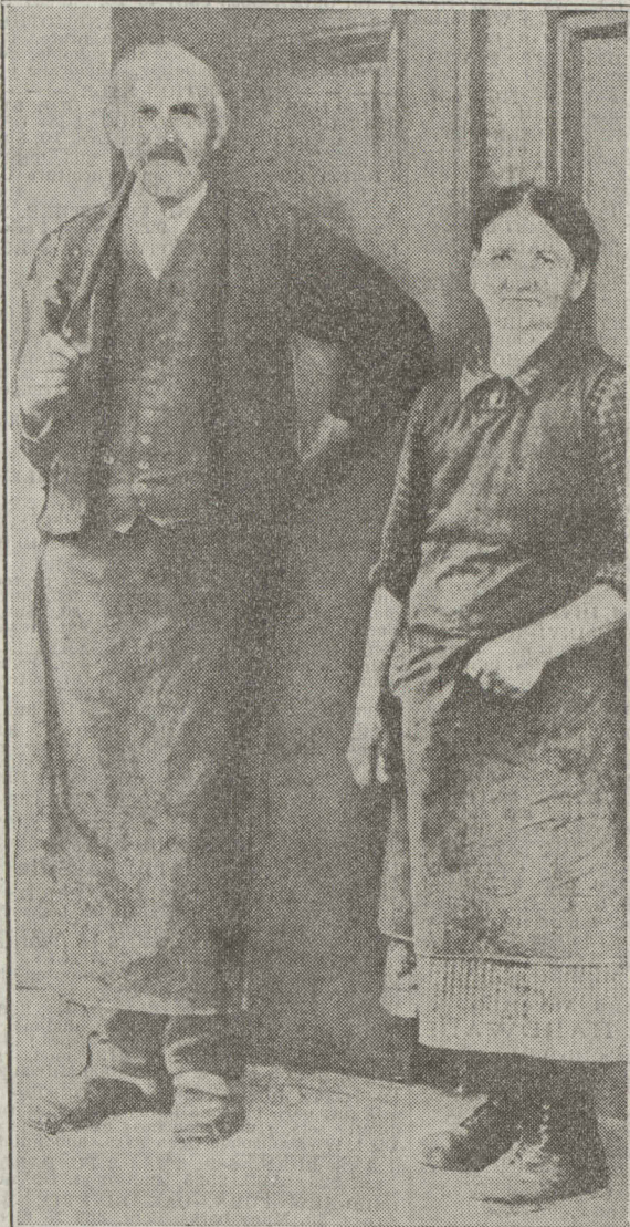
MOTHER MOURNS FOR DOLLFUSS. The peasant mother of slain Austrian chancellor with her second husband at cottage in Kirnberg, Austria. (Story on page 7.)