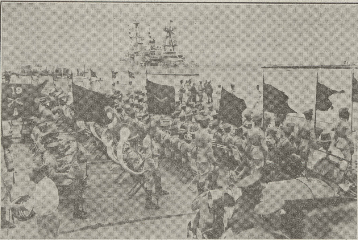
HAWAII BIDS FAREWELL TO ROOSEVELT; CRUISER SAILS FOR AMERICA. Troops on the dock at Honolulu as the U. S. S. Houston sailed away with President Roosevelt and his sons after visit to islands. He was the first President to visit the beauty spot in the Pacific. (Story on page 1.)