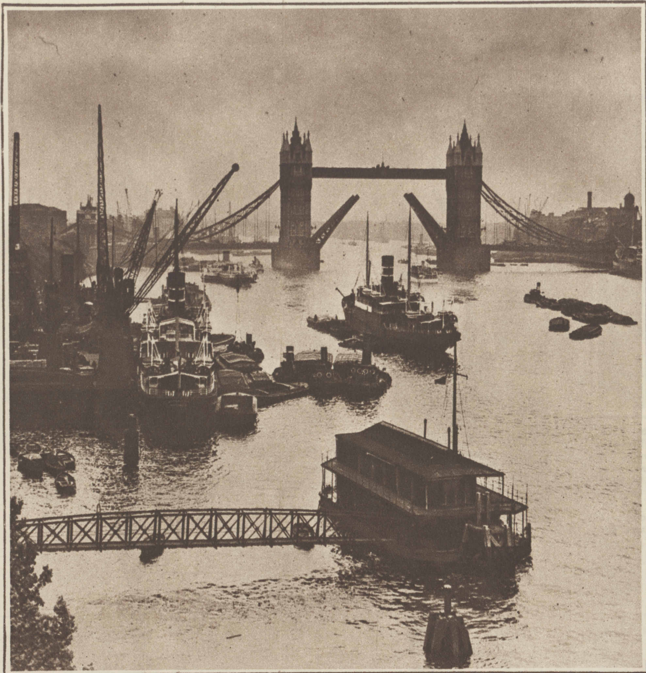
LONDON EVENING —The Tower bridge, leading across the Thames from the Surrey shore to that grim edifice, the Tower, now used principally as a storehouse for the trappings of royalty and as a public museum, but in other days the last earthly residence of condemned royalty, nobility, and commons, is seen in semi-silhouette against a gray evening sky.