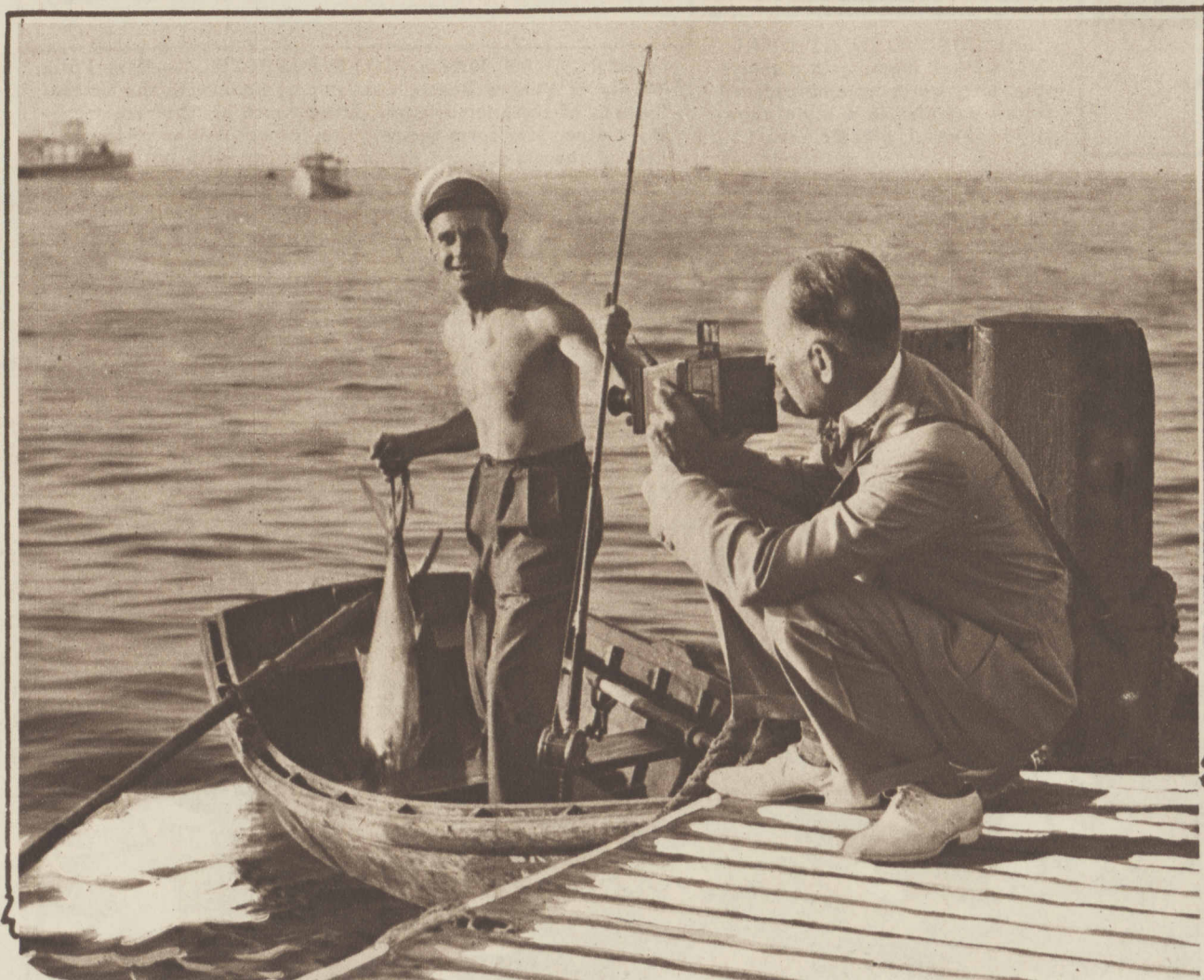
TWO PIONEERS AT CATALINA —Al Jolson, father of the mammy song, and Burton Holmes, whose lectures and stereopticon views make stay-at-home Americans yearn for foreign vistas, are pictured on vacation at Catalina island, off the Pacific coast.