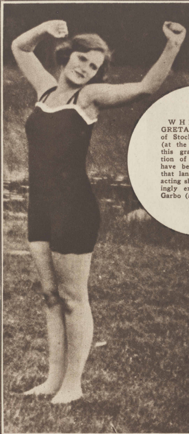
WHEN LITTLE GRETA GUSTAFSSON of Stockholm, aged 17 (at the left), posed for this graphic demonstration of ennui, she may have been training for that languorous style of acting she now so charmingly exhibits as Greta Garbo (at the right).