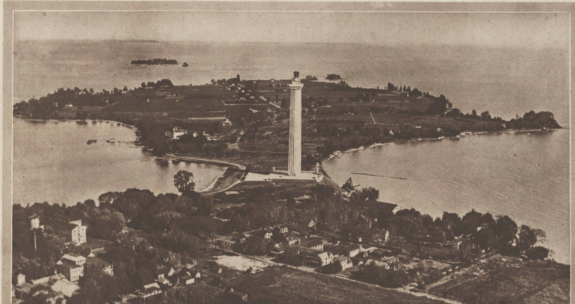
OVERLOOKING THE SCENE OF THE BATTLE OF LAKE ERIE is this 325-foot Doric shaft, commemorating the victory of Sept. 10, 1813, in which Oliver Hazard Perry defeated the British fleet. The recent dedicatory ceremonies on South Bass island, in the village of Put-In-Bay, were attended by prominent representatives of the United States and Canada.