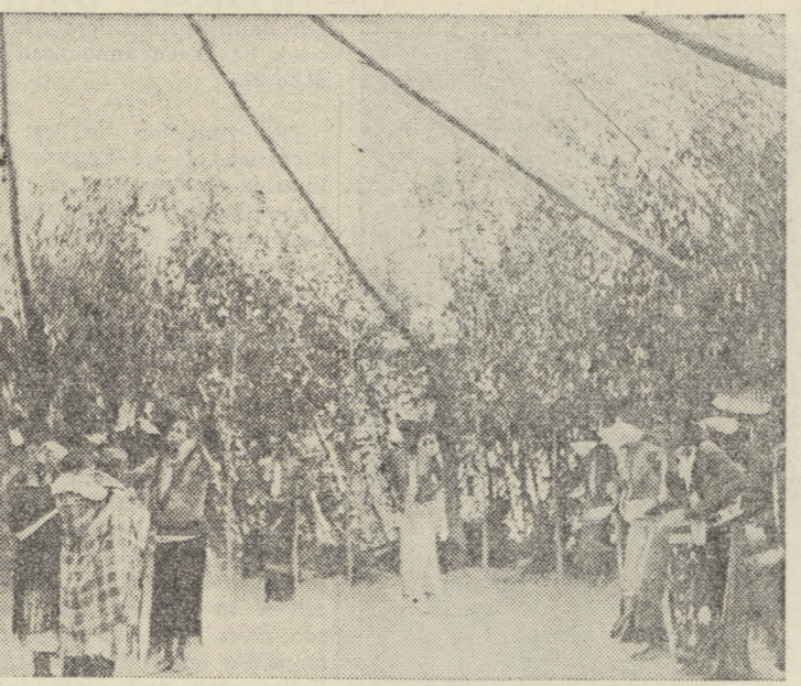
The sun dance of the Shoshone Indians in Wyoming. Note the papooses on the backs of the squaws at the left.

For three nights and two days no food or water passes his lips. On the fourth morning everybody faces the rising sun and offers thanks and still more prayers, prior to making a break for the river, there to enjoy a well earned—and much needed—bath.