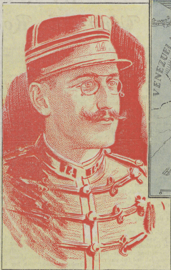
Dreyfus, who served five years on Devil's island before he was found innocent of treason and released.