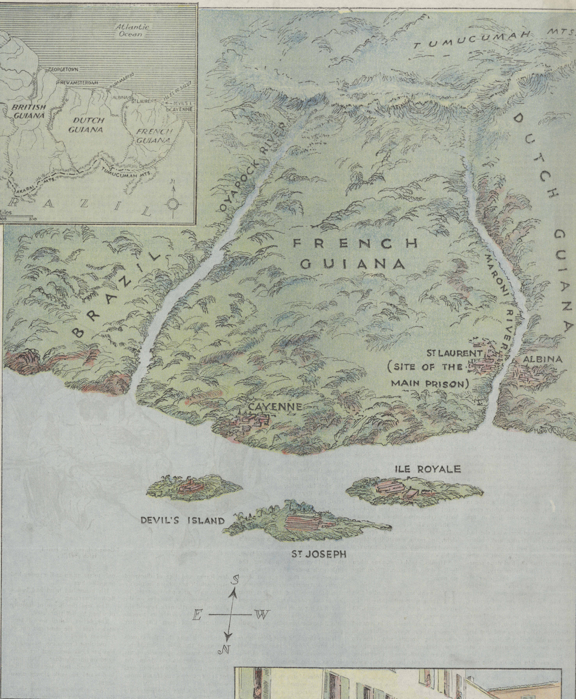
The prison colony popularly known as Devil's island actually is divided between Cayenne and St. Laurent, on the mainland of French Guiana; Devil's island, St. Joseph, and Ile Royale. Smaller map indicates position of the colony on the coast of South America. Convicts attempting escape face peril of death at sea or in the dreaded jungle.

solitary confinement. The prison hospital is located on Ile Royale.