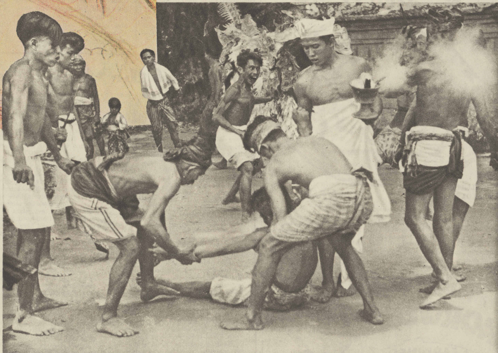
A fanatical dance of Bali is known as the dagger dance. Carried away by their performances, the participants in the dance often stab themselves with their krises. Here one is being disarmed to prevent self-injury.