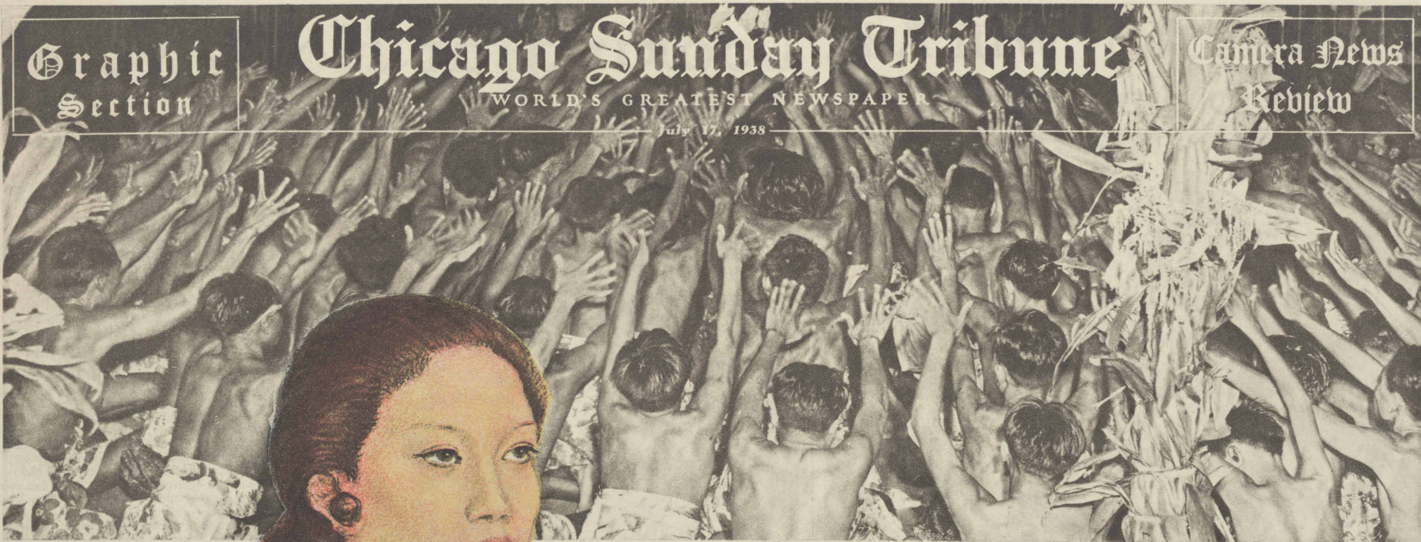
Above: Believing they are thus banishing illness and distress, the Balinese every five years celebrate the monkey dance, a legendary rite observed in the village of Bedhulu.