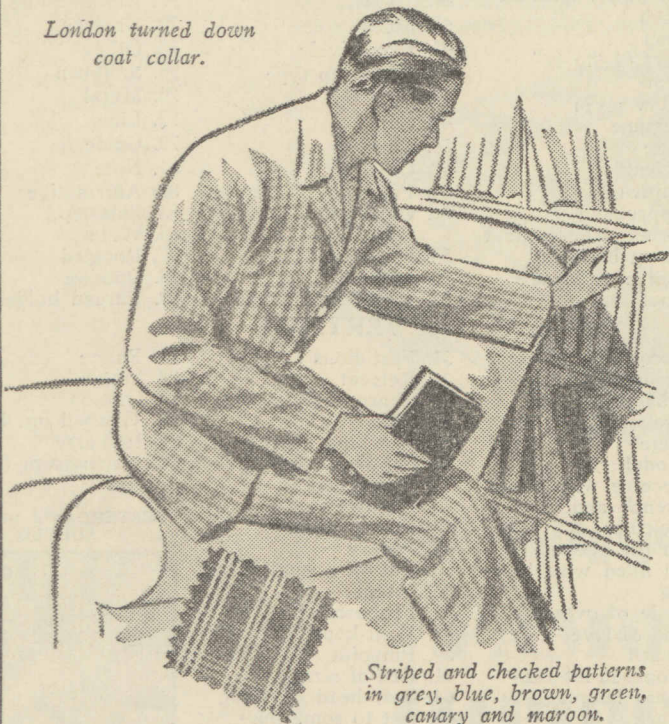
Striped and checked patterns in grey, blue, brown, green, canary and maroon.

The luxuriousness of the silk and the calibre of the workmanship to which it has been subjected would normally entitle these imported P.J.'s to an impressively higher price. However, our recent trip to the Orient enabled us to go to the source of the fabric, and select odds and ends of unusually fine silks, which we had tailored there over our own design.