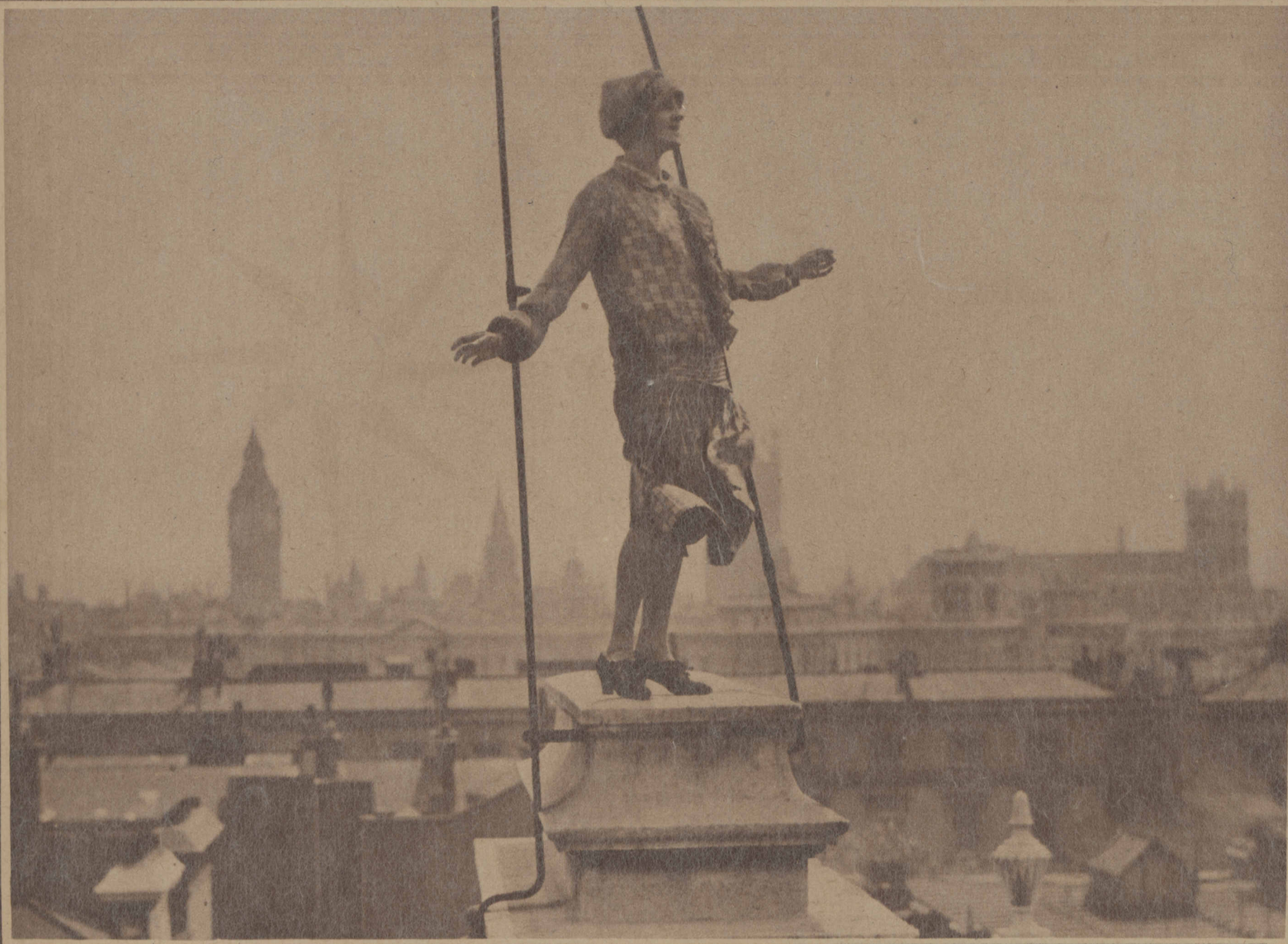
LONDON AT HER FEET —Miss Elsie Janis, making her first theatrical appearance in the British capital for several years, took this breezy posture atop her hotel while the camera made its record.