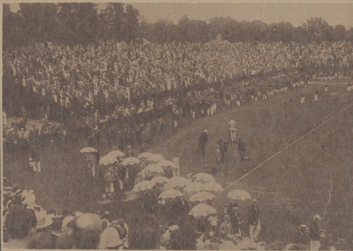
THEY'LL NEVER BE ALL WET AT PRINCETON in the class day parades as long as umbrellas are on sale. Three thousand alumni marched in the parade and filled the stands at this baseball game with Yale.