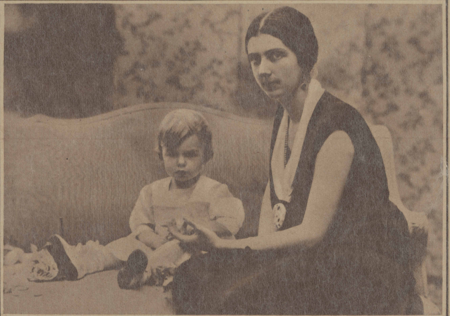
OF ROYAL ROMAN BLOOD —Princess Yolanda of Italy and her small son in their first posed picture together. By marriage, as you no doubt remember, Yolanda is the Countess di Bergolo.