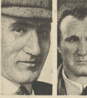
Donald Crisp in As Burkitt in a role of eight- "Mutiny on the een years ago. Bounty."

Hollywood. TN "Daughters Courageous" the picture leans heavily on the characterization of the stolid, reliable town banker who