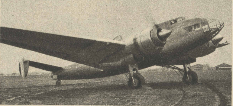
A heavy bomber capable of 311 miles an hour at 25,000 feet. It is a Leo 45.

loaded the plane weighs 24,200 pounds. Its ceiling is 29,000 feet, oping 825 horsepower for take- and it cruises at 270 miles an hour at 16,400 feet. In the air ing this American engine in it is a slick, streamlined fish, for France under license. With the the main landing wheels and Hispano motors the plane has tail wheel and the gunner's tura top speed of 285 miles an hour. ret on the fuselage retract with-It takes off in 250 yards and has in the wings and the hull.