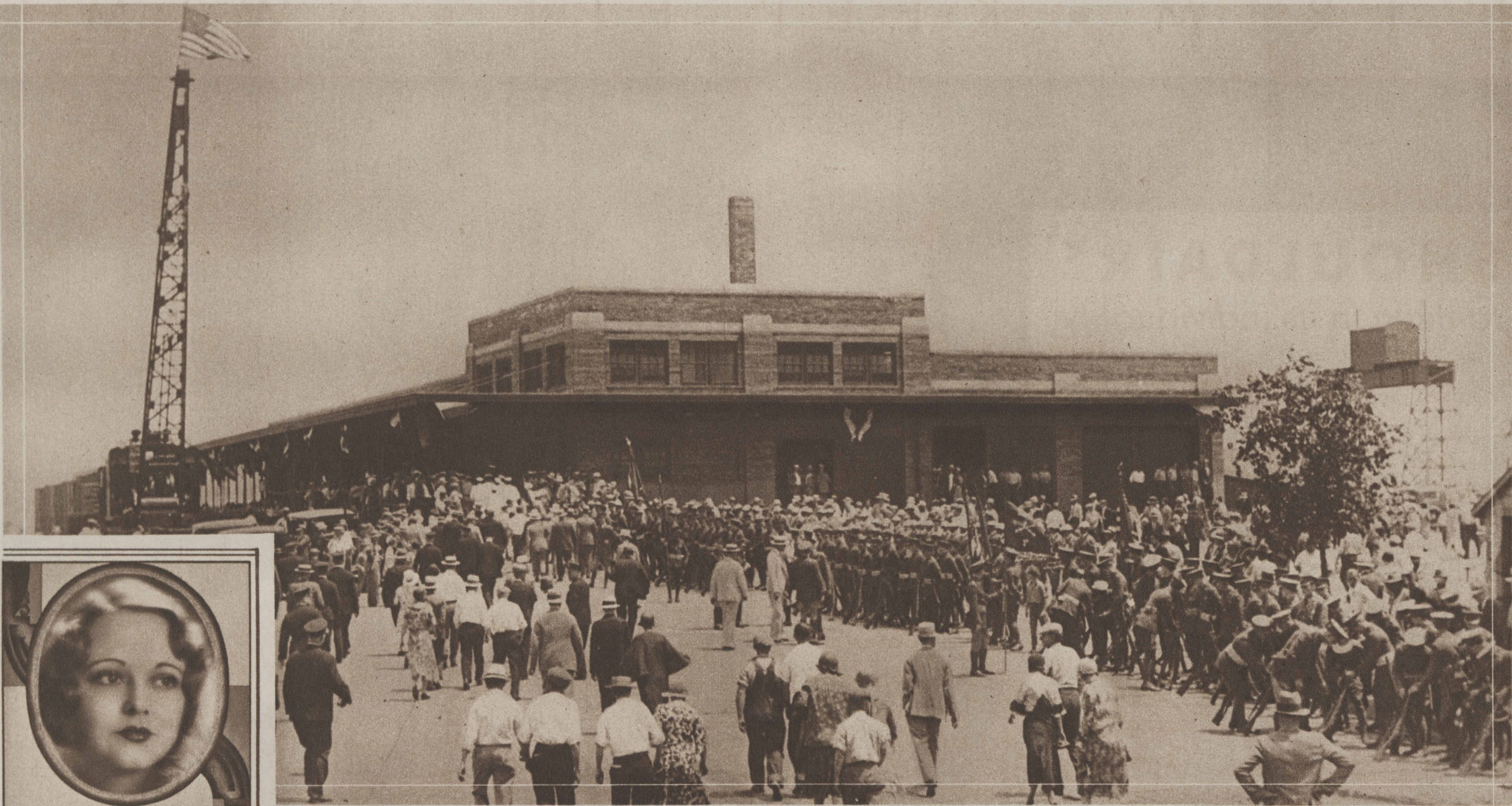
WHEN PEORIA DEDICATED A $400,000 RIVER AND RAIL TERMINAL—A view of the warehouse as throngs gathered to hail the completion of a new step in the lakes-to-gulf waterway. Secretary of War Hurley spoke at the celebration, and during the day the first fleet of barges arrived with cargo from Mississippi river ports.