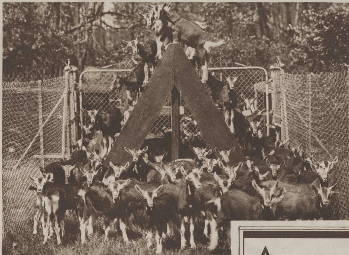
JUST KIDS—A herd of pure-bred Toggenburgs makes a pyramid of goat on the Charles A. Stevens estate at Delavan Lake, Wis. In the Farm and Garden department of today's Tribune Paul Potter writes of this herd and of the four to five daily quarts of milk a good goat will give.