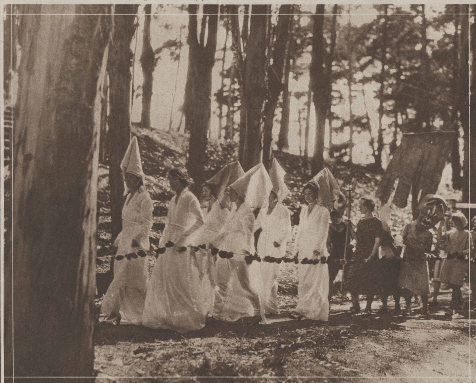
A CAMPUS PAGEANT STRIKES A CLASSICAL NOTE—Commencement at Mills college, Oakland, Cal., brings a picturesque "dance drama" to view. These characters are spinners, homeward plodding their weary way from the mill.

OUR $25.00 PERMANENT WAVE Temporarily $10.00 OUR $15.00 WAVE Temporarily $7.50