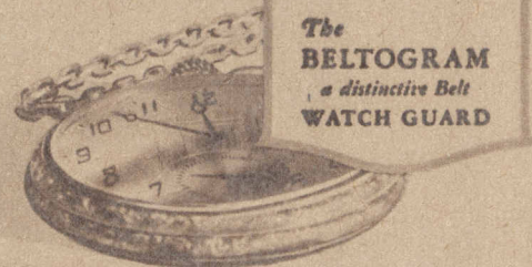
The BELTOGRAM a distinctive Belt WATCH GUARD

Illustrated—Belt of full grain cowhide bridle with lattice stripe design in color. Buckle of sterling silver beautifully engraved, with border and initial in inlaid black enamel. . . . $3.00 Belt, Buckle and Beltoqram complete $5.00