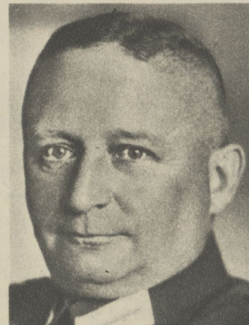
Gen. Ferdinand von Bredow