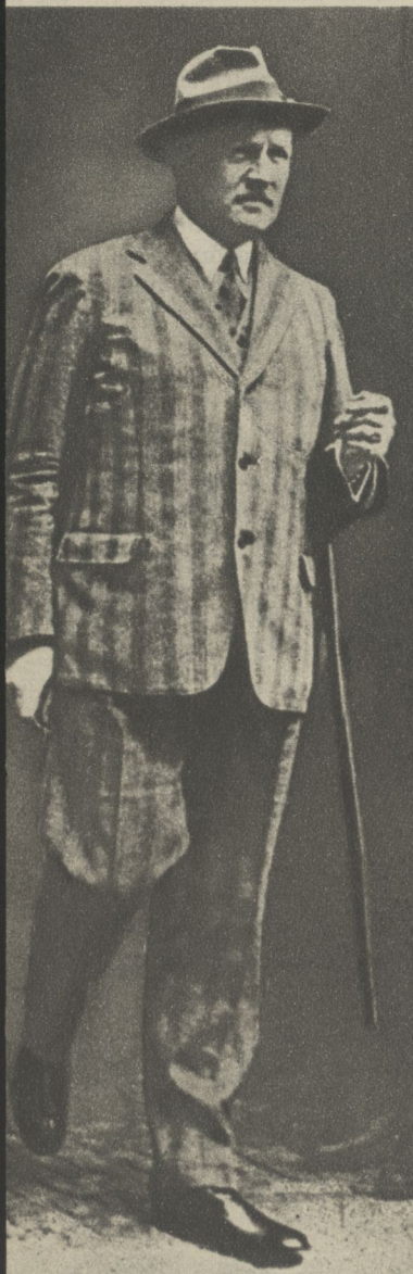
Gen. Kurt von Schleicher