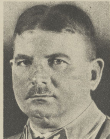
Capt. Ernst Roehm