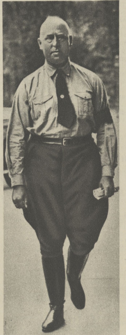
Gregor Strasser