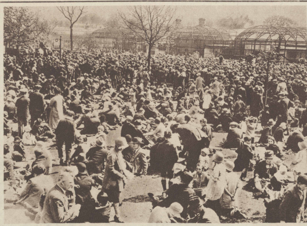
IT'S LUNCH TIME at the London zoo for this holiday crowd as well as the animals. Those of the throng who have satisfied their own appetites are watching the gustatory performance of the jungle citizens with much interest.