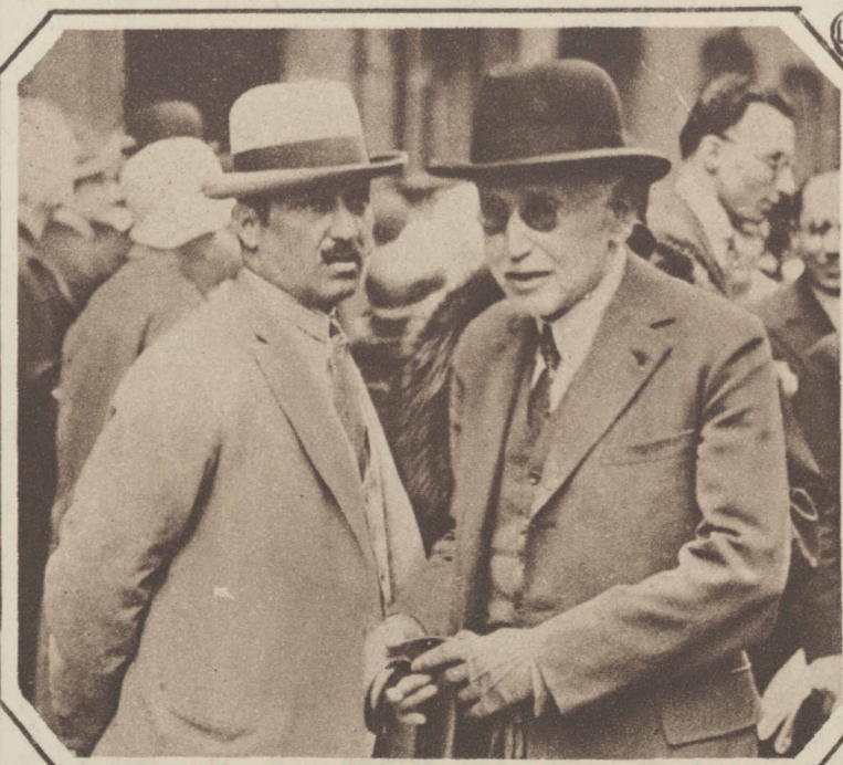
CONDEMNED TO DEVIL'S ISLAND on a charge of treason which stirred France and most of the world, Lieut. Col. Alfred Dreyfus was ultimately freed through the intervention of Emile Zola. Colonel Dreyfus, with the dark glasses, is shown attending the services in which a memorial plate was placed on the Paris home of the famous novelist.