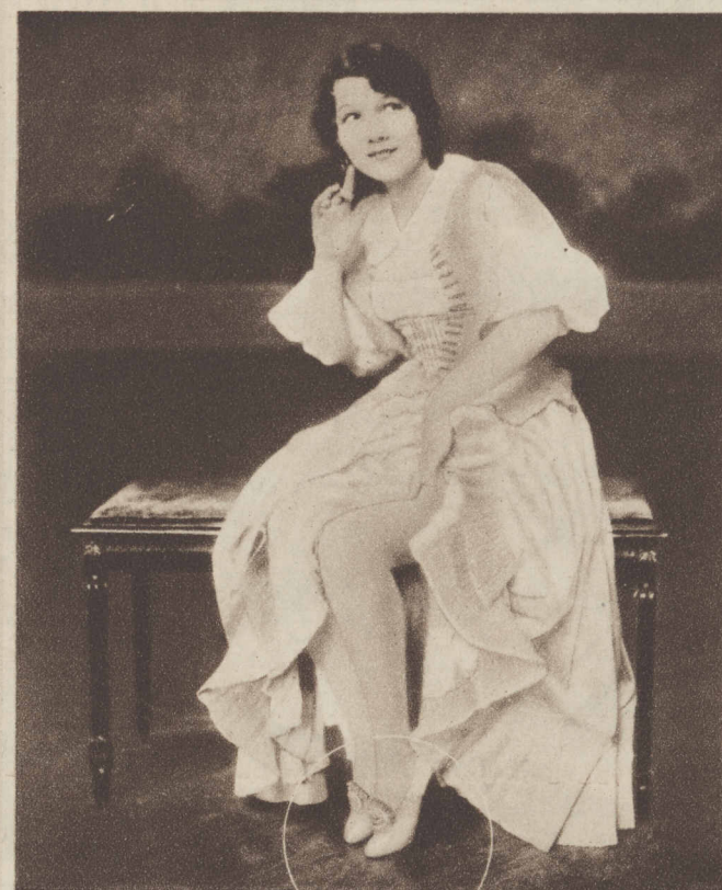
VIVIENNE SEGAL'S Famous Feet

"Tolerate a corn? How mid-Victorian in these modern Blue-jay days!" So writes Vivienne Segal, co-star of "Three Musketeers." . . . Ending a corn with Blue-jay is gentle and sure. No danger of infection, as with self-paring. Relief is instant . . . for the cushiony pad stops shoe-pressure and pain at once. And shortly the corn makes its adieu. At all drug stores. For calluses and bunions, ask for the larger size Blue-jay.