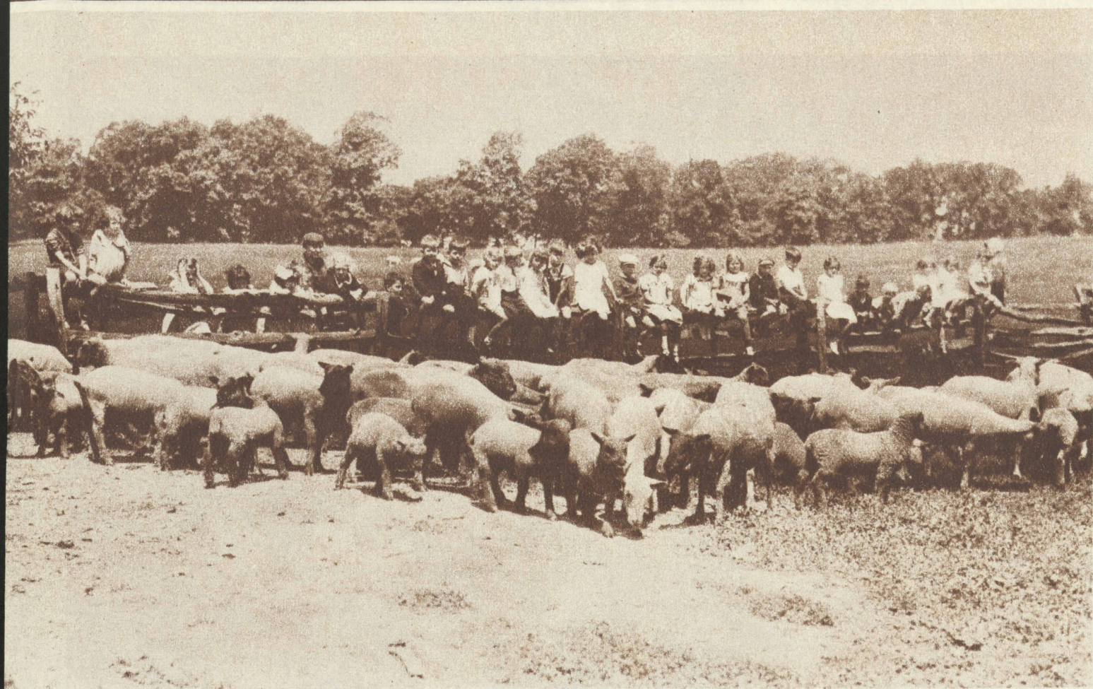
VISITING THE TRIBUNE'S EXPERIMENTAL FARM AT WHEATON—First grade pupils of Cicero watch the sheep from a rail fence.