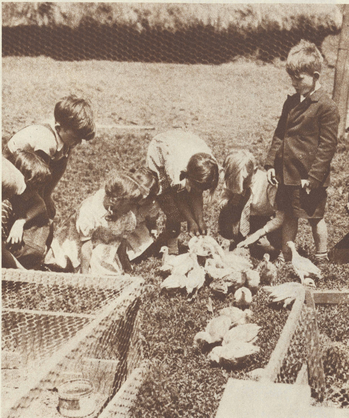
GETTING ACQUAINTED WITH FEATHERED CREATURES—Cicero children feeding baby turkeys and chicks.