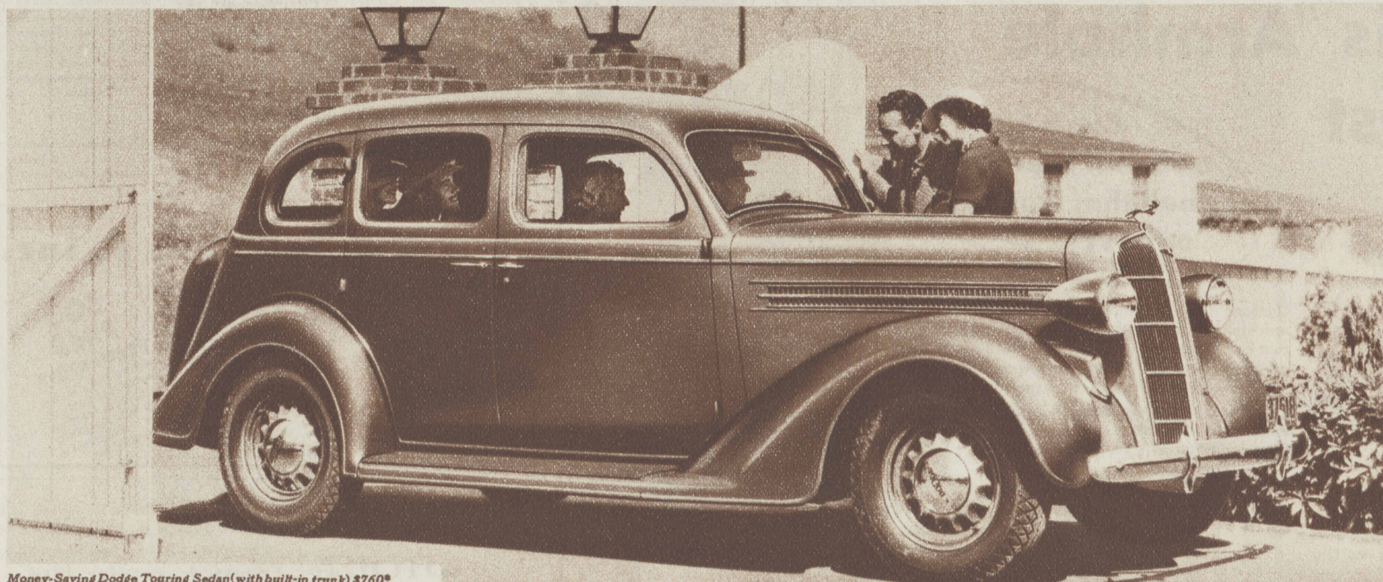
Money-Saving Dodge Touring Sedan (with built-in trunk) $760*

ROY CHAPMAN ANDREWS, famous explorer: "Dodge helped me blaze the way through the trackless wastelands in the Far East. Many times we staked our lives on the dependability of Dodge cars."