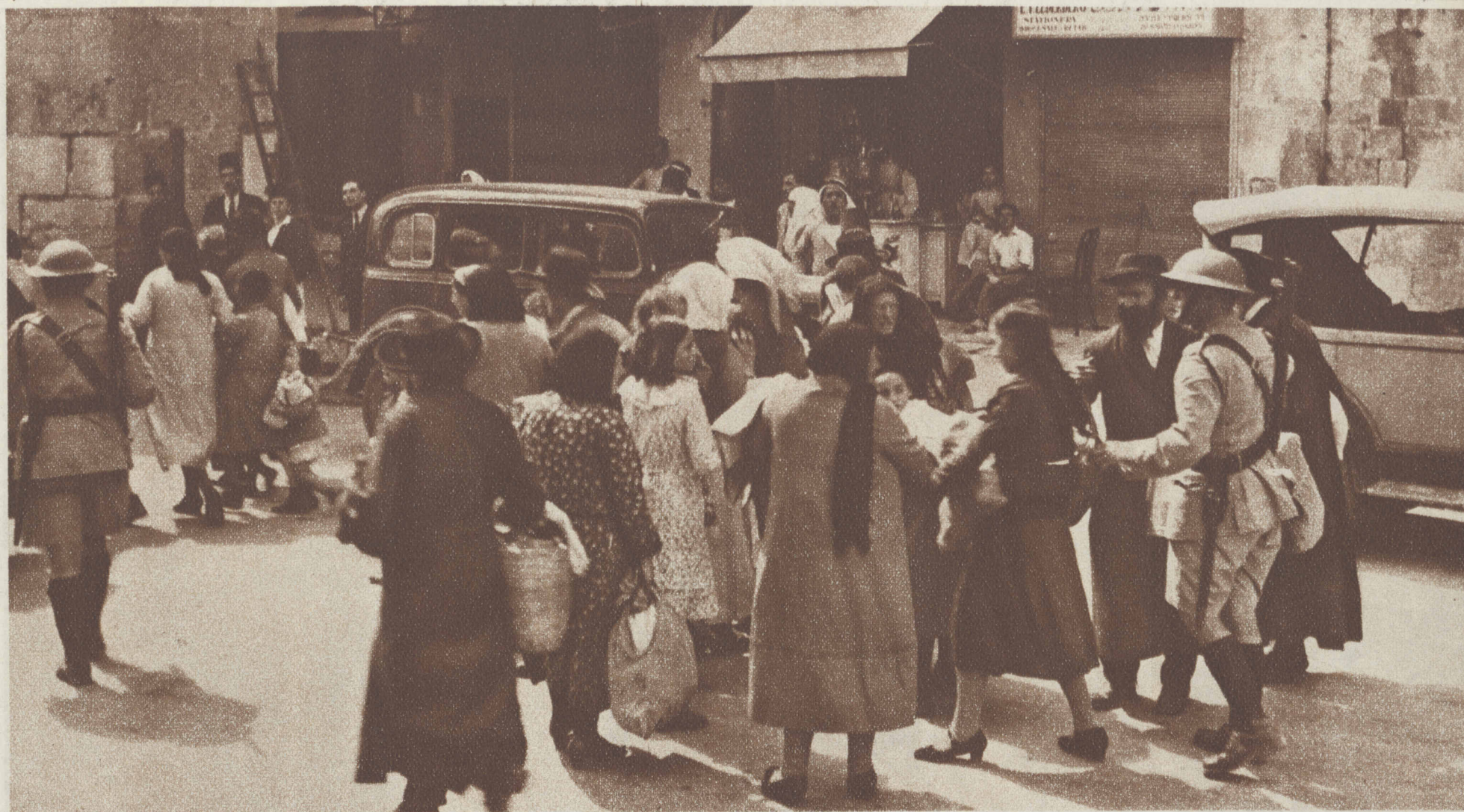
REFUGE IN THE HOLY CITY—A British soldier shepherding Jewish peasants who seek safety in Jerusalem from warring Arabs.

Out of Town Residents—Send your mail orders to the Main Kitchen—357 North Central Park Ave., Chicago. Add 5¢ a lb. to cover postage and special packing.