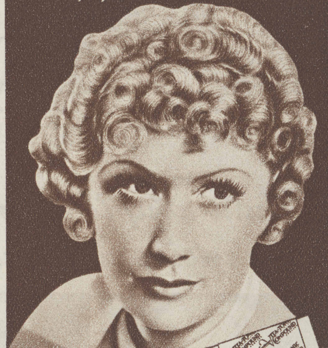
MIRIAM HOPKINS in Samuel Goldwyn's "SPLENDOR"

Ask To See The Wrappers Used On Your Hair