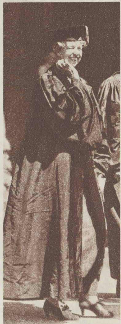
COMMENCEMENT SPEAKER—Mrs. Roosevelt in cap and gown at Drake university, Des Moines, Ia.