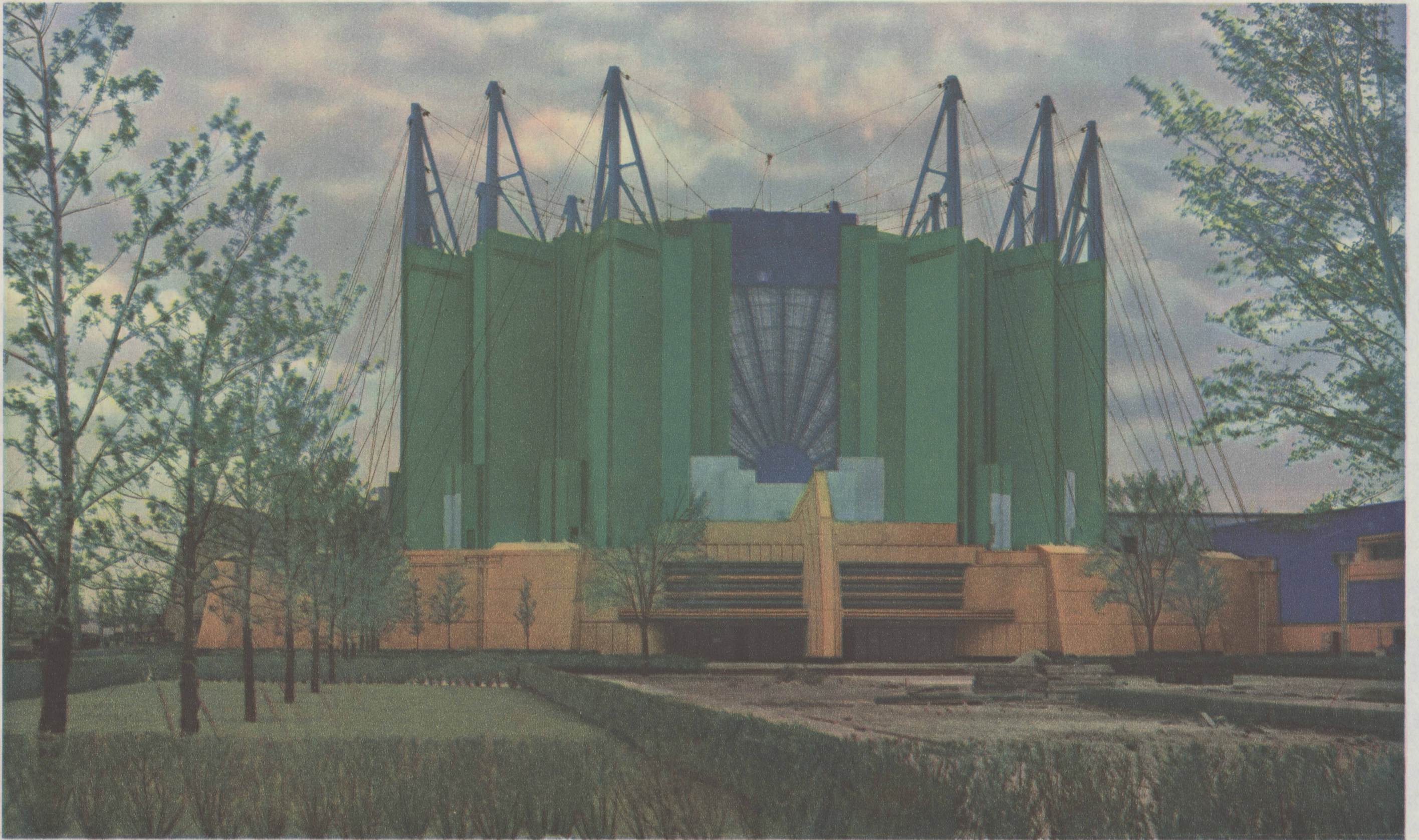
THE TRAVEL AND TRANSPORTATION BUILDING AT A CENTURY OF PROGRESS EXPOSITION.