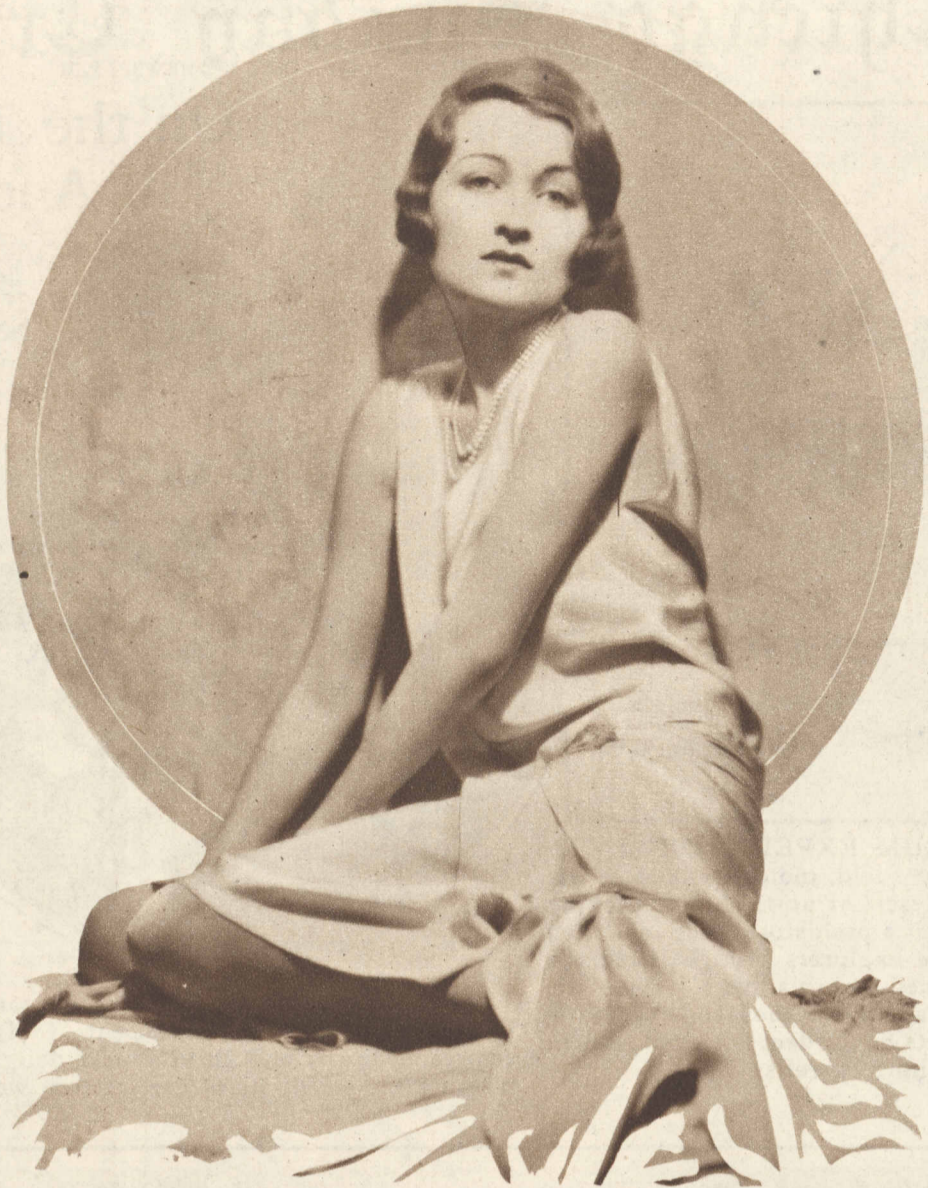
CONSTANCE BENNETT, the latest one to remark that work, not riches, brings happiness, has gone to Hollywood to appear in talking pictures for Pathe. She's the daughter of Richard Bennett—as of course you know.