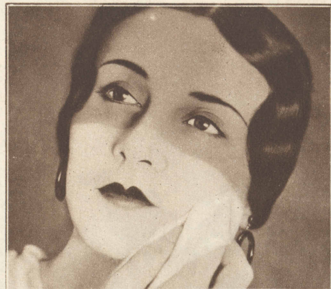
Creamed magnesia beautifies the skin in the same easy way that milk of magnesia purifies the stomach