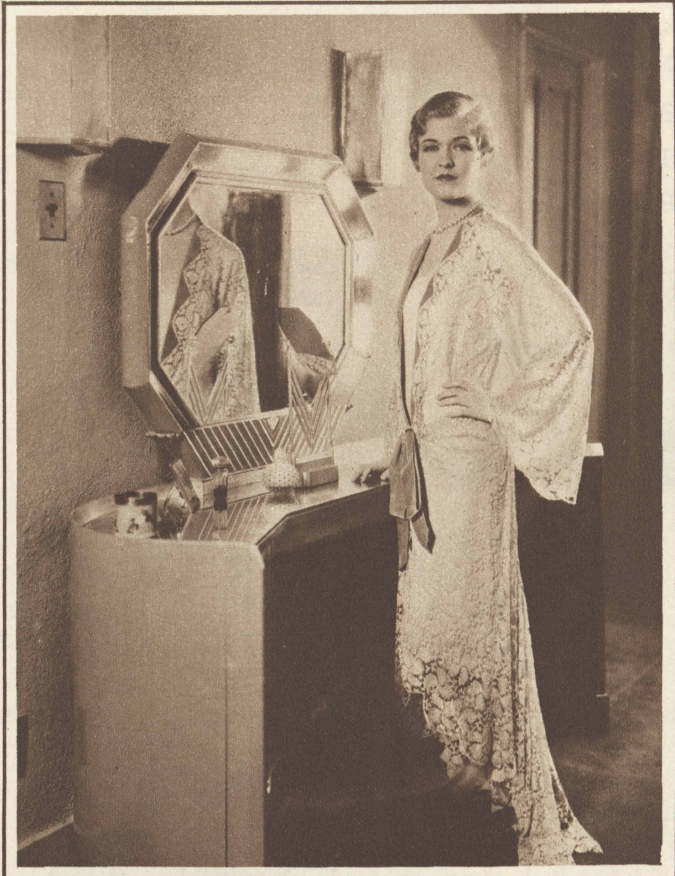
LAURA LA PLANTE posed for this pretty picture in her dressing room. The last film to feature this popular actress was "Scandal." See it?