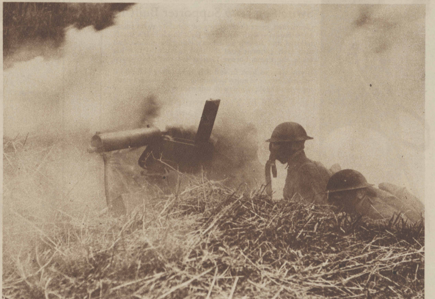
ONE OF THE NIGHTMARES OF MODERN WARFARE is simulated at Fort Sheridan as masked machine gunners fire through a smoke screen. They were in rehearsal for the military show which is to begin at Soldiers' field next Saturday and which, it is forecast, will be one of the nation's most imposing martial tournaments.