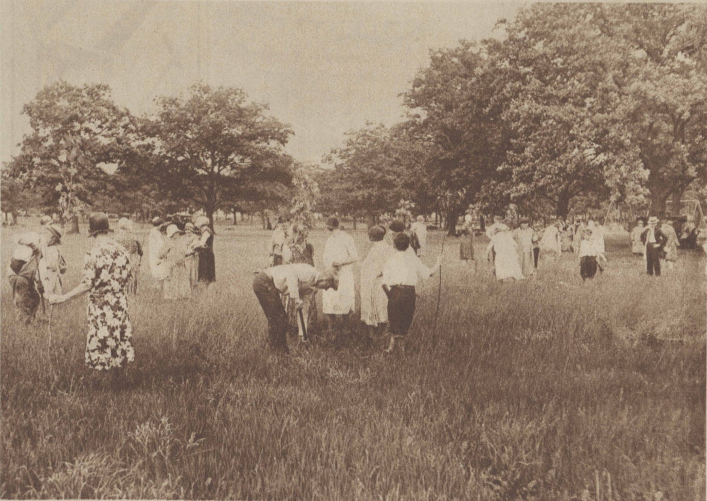
LIVING MEMORIALS —The Chicago and Cook County Federation of Women's Organizations, in its fourth annual tree planting, sets and dedicates trees in Ryan's woods, forest preserve, in tribute to notable Chicagoans of these and other days.