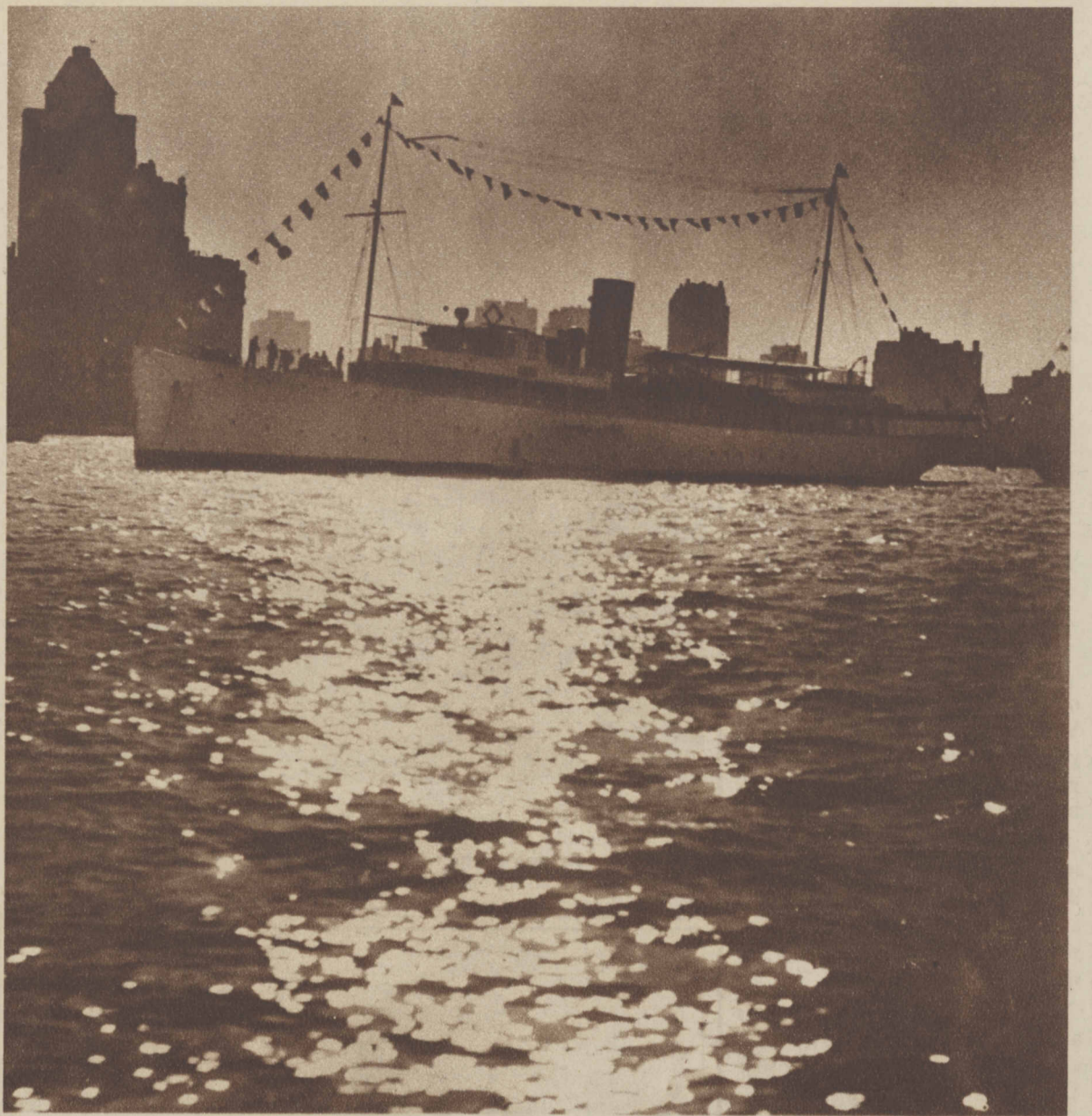
CHICAGO SUNSET —Silver spangles showered upon the lake throw into relief the Mizpah, Commander Eugene F. McDonald's luxurious yacht, anchored off Chicago avenue. The trim vessel but recently returned from a 20,000 mile exploration cruise in the south seas.