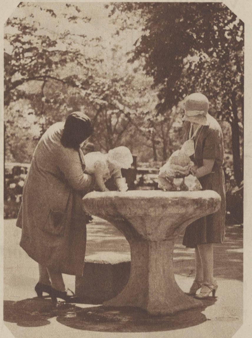
AMONG US MORTALS IN CHICAGO'S PARKS —Refreshments are served at a public drinking fountain, demonstrating that there are other ways of getting a drink besides quaffing from the old oaken bucket.