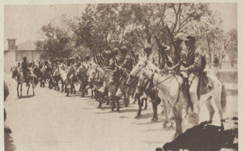
HORSE MARINES—A mounted force returns from combat patrol in Nicaraguan mountain fastnesses.