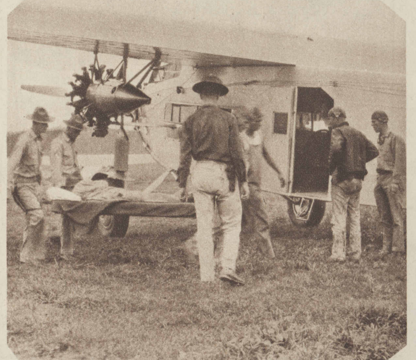
A FLYING AMBULANCE—A marine wounded in northern Nicaragua is sped by plane to the hospital.