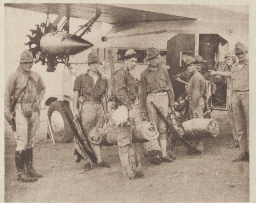
SOLDIERS OF THE SEA TRAVEL BY AIR—To the marines remaining in Nicaragua, as the United States gradually withdraws the forces that have been keeping the peace there, the airplane is indispensable. Men with full equipment here embark for isolated outposts.