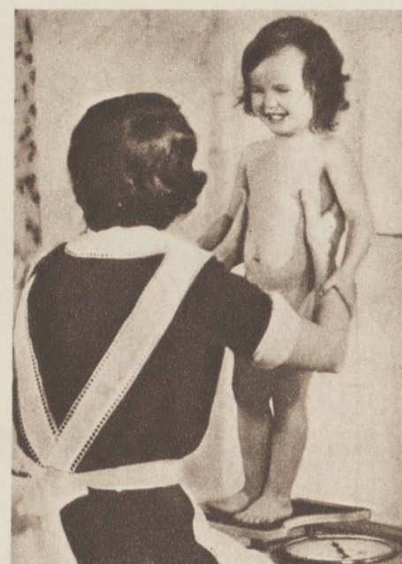
Eats Better and Gaining Weight She Seems Like a Different Child

(Note: Thousands of nervous people, men and women are using Ovaltine, on physicians' advice, to restore vitality when fatigued. It is also widely recommended for sleeplessness, nursing mothers, convalescents, and the aged.)