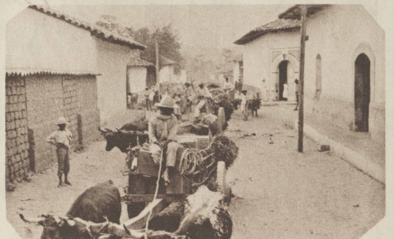
AT THE OTHER END OF TRANSPORTATION CHRONOLOGY—In strange contrast to the Americans' swift planes, an ox cart train makes its leisurely way through Ocotul with food for hungry marines.