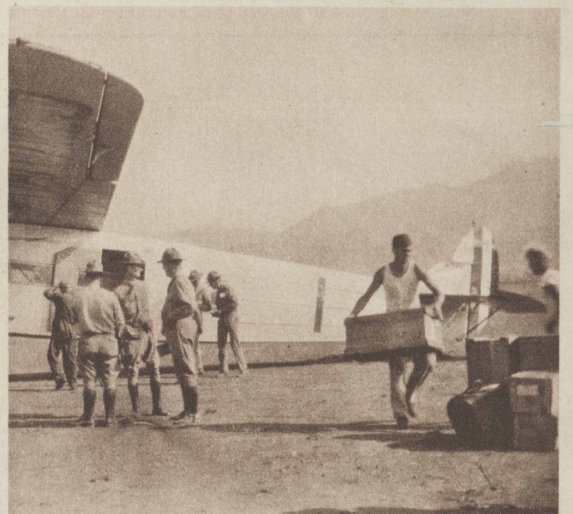
FREIGHT SERVICE IS AUXILIARY—A transport plane delivers supplies to a spot in Nuevo Segovia province which is almost inaccessible by other means of travel.