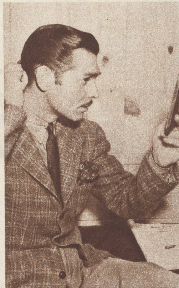
CO-STAR with Miss Harlow in "Saratoga" was Clark Gable, also perfecting makeup before going on the set.