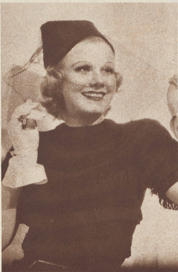
A NEW FASHION donned by Miss Harlow became spectacular. This is a typical fashion picture by Ted Allan, studio photographer.