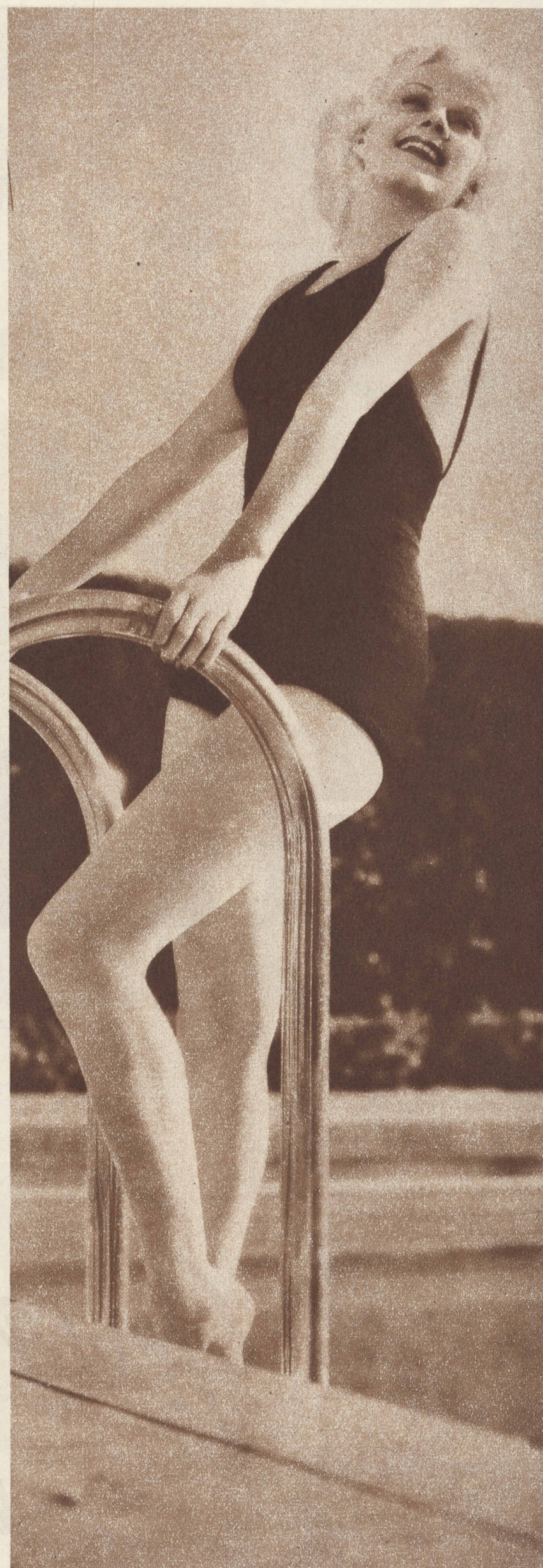
HER VIVID PERSONALITY was a delight to still men, those artists of the camera whose skill enhances the glamor of film beauties. This study is by Hurrell, one of Hollywood's ace photographers.