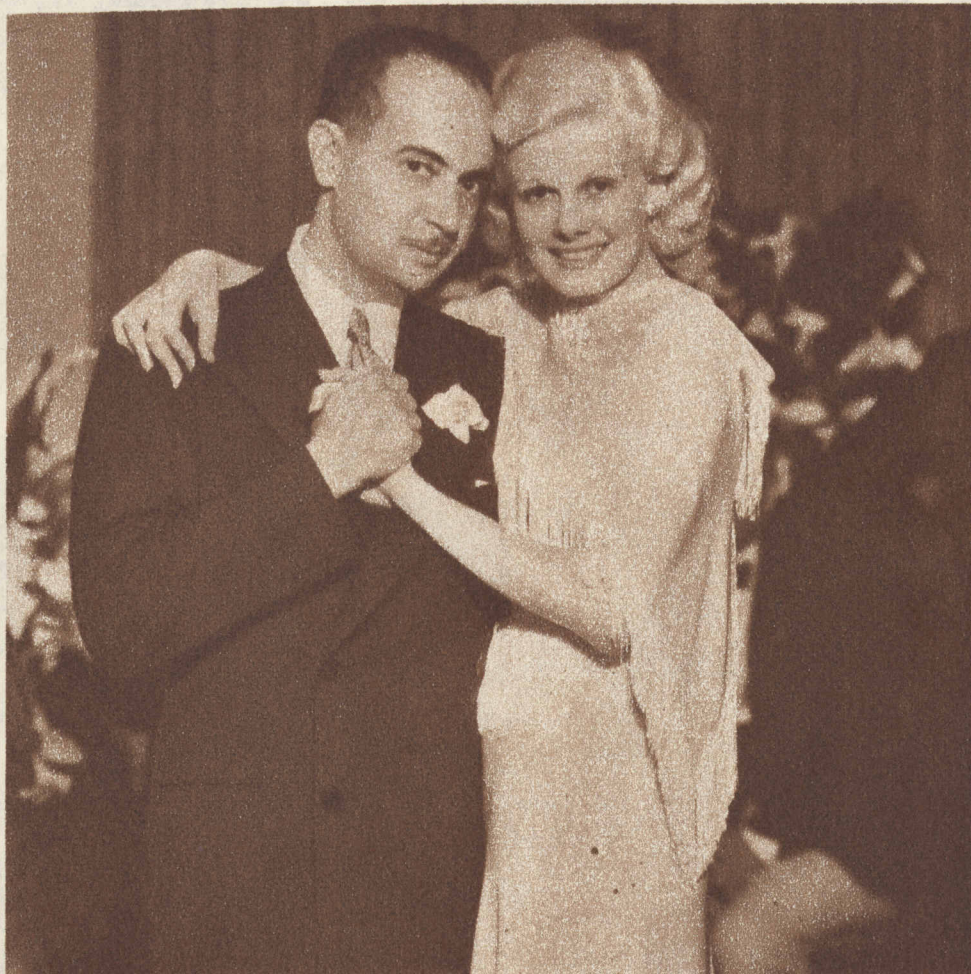
A TRAGEDY of Jean Harlow's life was the suicide of her husband of two months, Paul Bern. The studio executive took his life in September of 1932. The newlyweds posed for this picture immediately following their marriage.