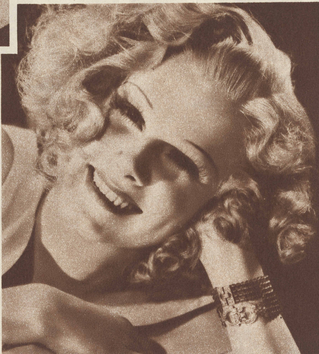
THE PLATINUM BLONDE BECAME A "BROWNETTE" some months ago. The press agent described the new shade as "a fusion of brown and blonde."