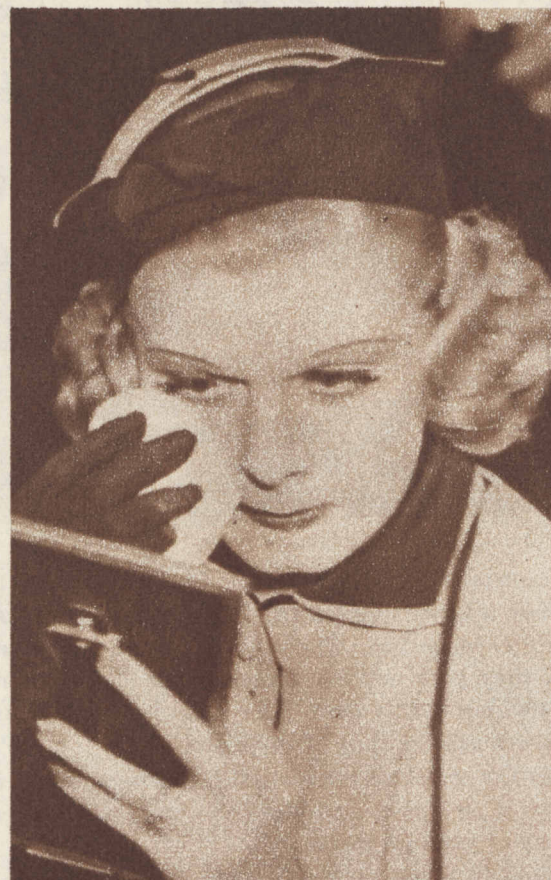
THE UNFINISHED PICTURE in which Miss Harlow was working when she fell ill, "Saratoga," will be scrapped. In this scene, she was adjusting makeup as she prepared to go before the camera.