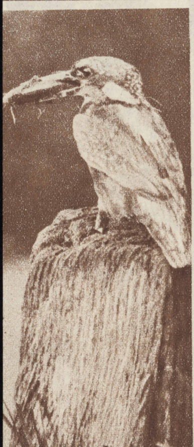
KINGFISHER AND ITS CATCH.

IN A NEW PHOTOPLAY, "Turn Off the Moon," Eleanor Whitney and Johnny Downs are teamed for a blithesome dance.