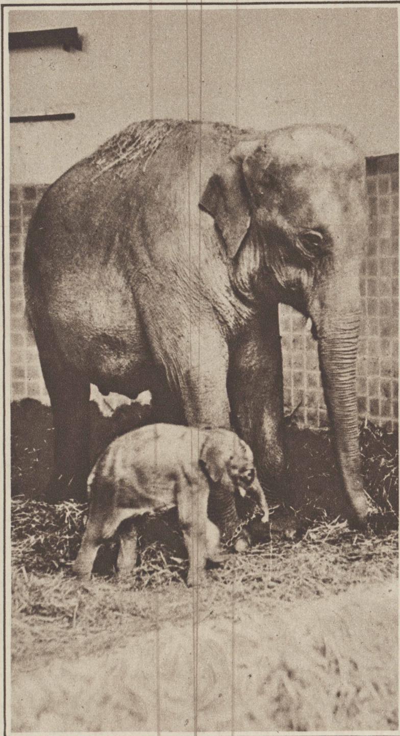
MOTHER AND SON—The newborn baby elephant at the zoo in Munich, Bavaria, is seen with his mother.