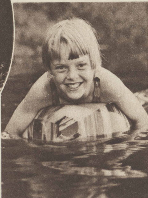
For the Child Who Is Underweight and Nervous