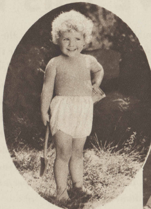
For the Child who Doesn't "Build Up" and Sleeps Poorly

NOTE: Thousands of nervous people, men and women, are using Ovaltine to restore vitality when fatigued. It is also highly recommended by physicians for sleeplessness—for nursing mothers, convalescents, and the aged.