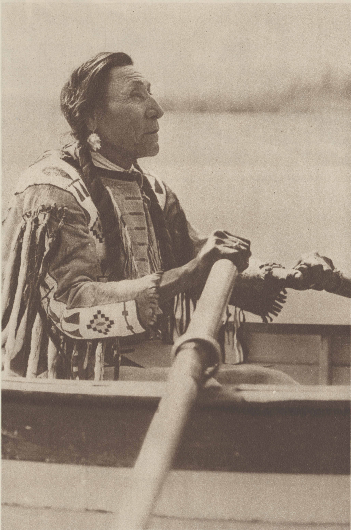
A BLACKFOOT BRAVE in Glacier National park, Montana.