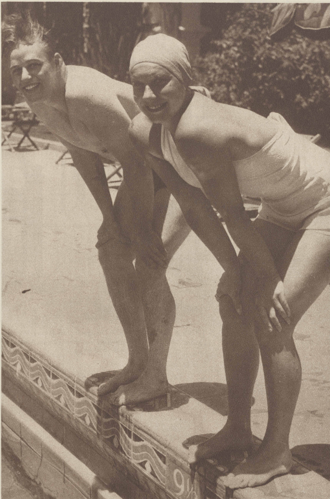
ELLIOTT ROOSEVELT, son of the President, and Helene Madison at a pool at Agua Caliente, Mexico.