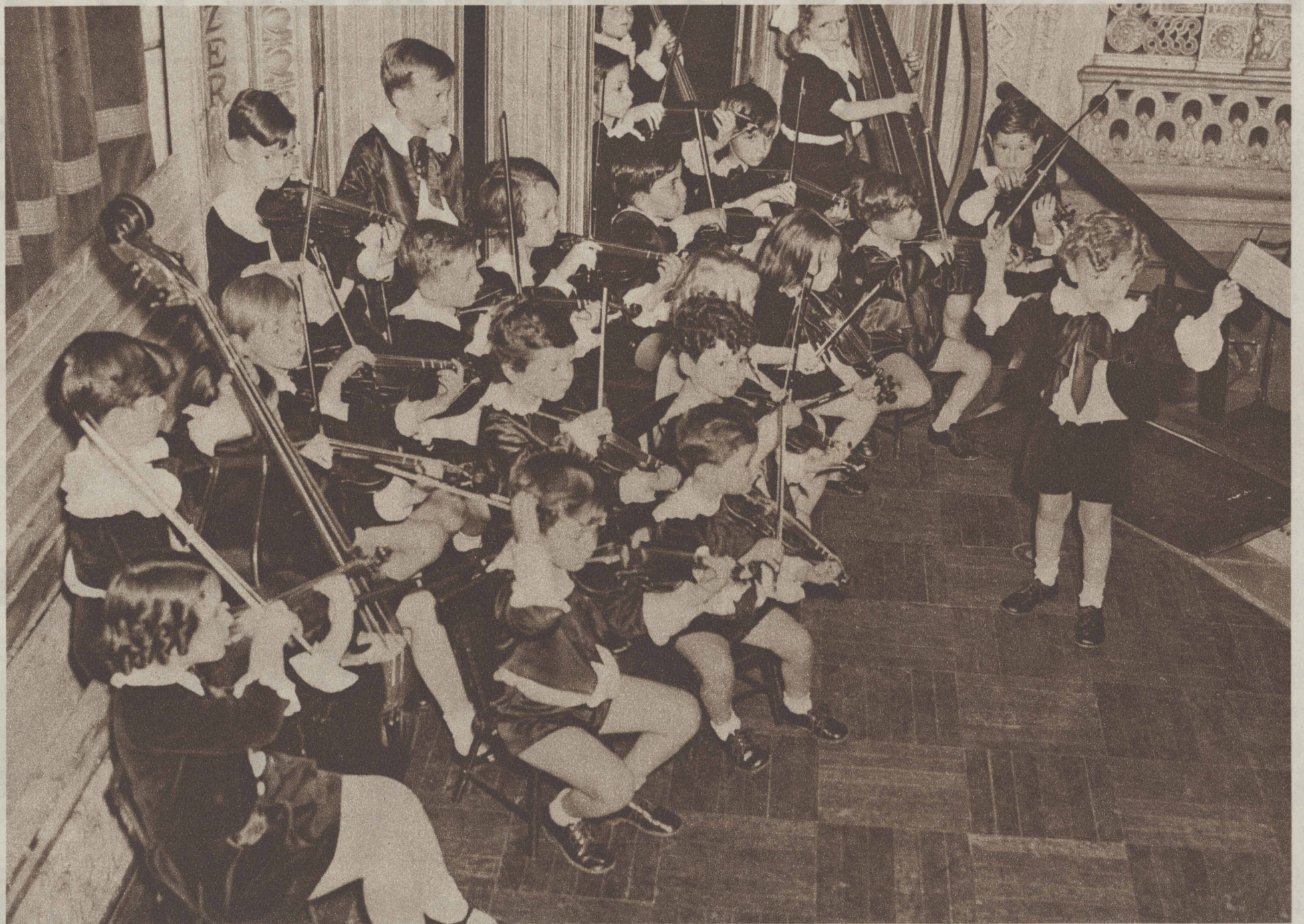
A BABY ORCHESTRA the age of whose members ranges from two to seven years practicing in the New York City Auditorium.