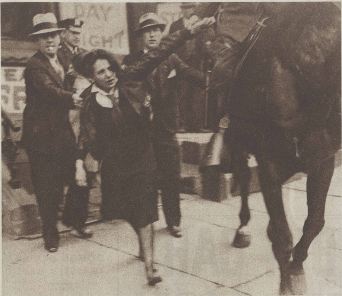
A WOMAN ANTI-HITLER DEMONSTRATOR arrested at the North German Lloyd pier in New York City.