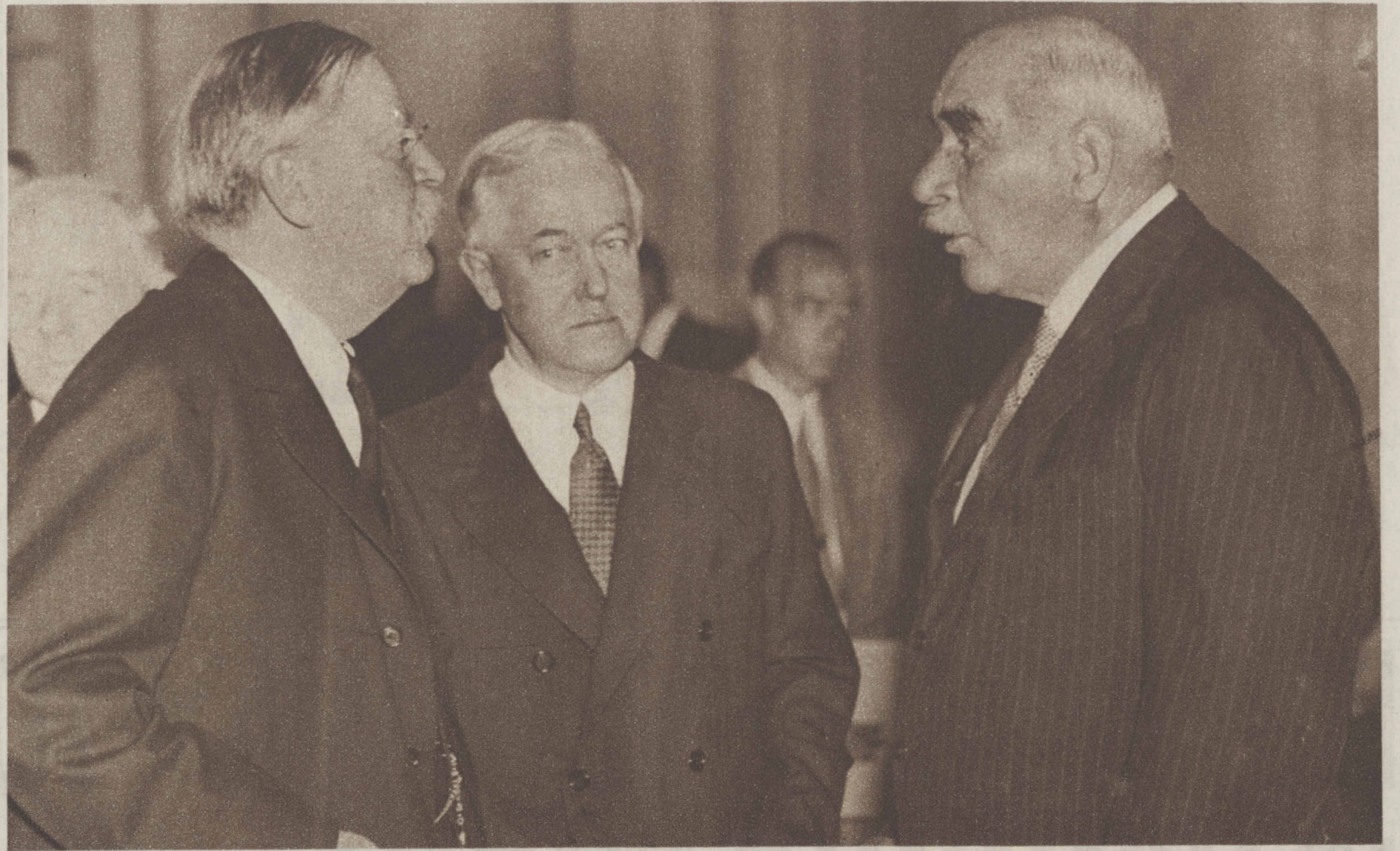
J. P. MORGAN, at right, in animated conversation with Senator Kean of New Jersey, at left, and John W. Davis, during the recent senate hearing.