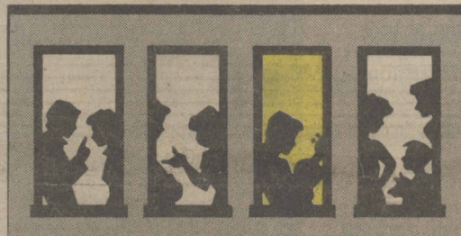
■ This is the fourth in a six-part series.

He could drift through the fantasies until a door slammed or his kids started yelling or a command cracked the air like a whip: "Take the garbage out, Phil."