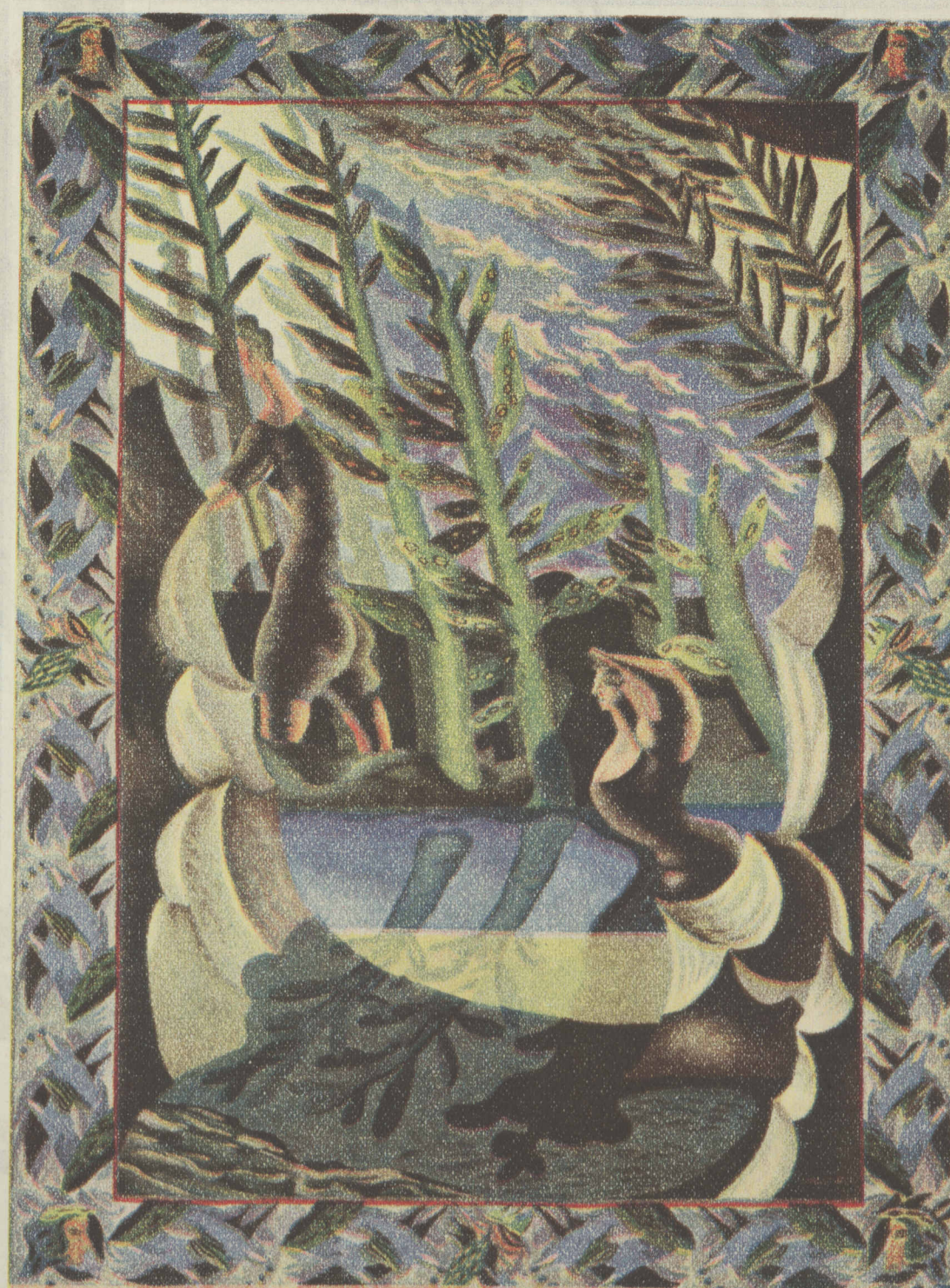
L'ORAGE: Designed by Jean Lurcat