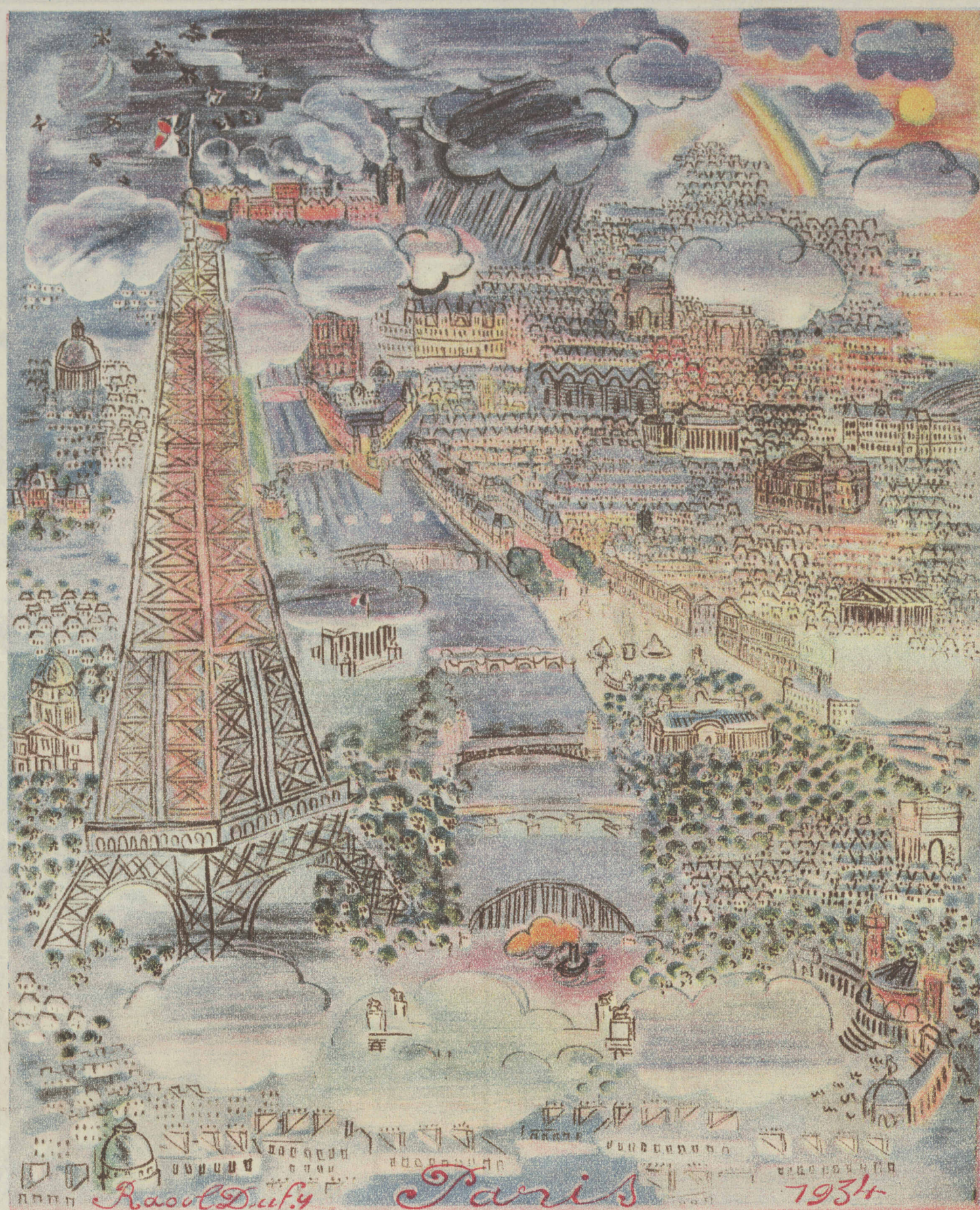
PANORAMA DE PARIS: Designed by Raoul Dufy