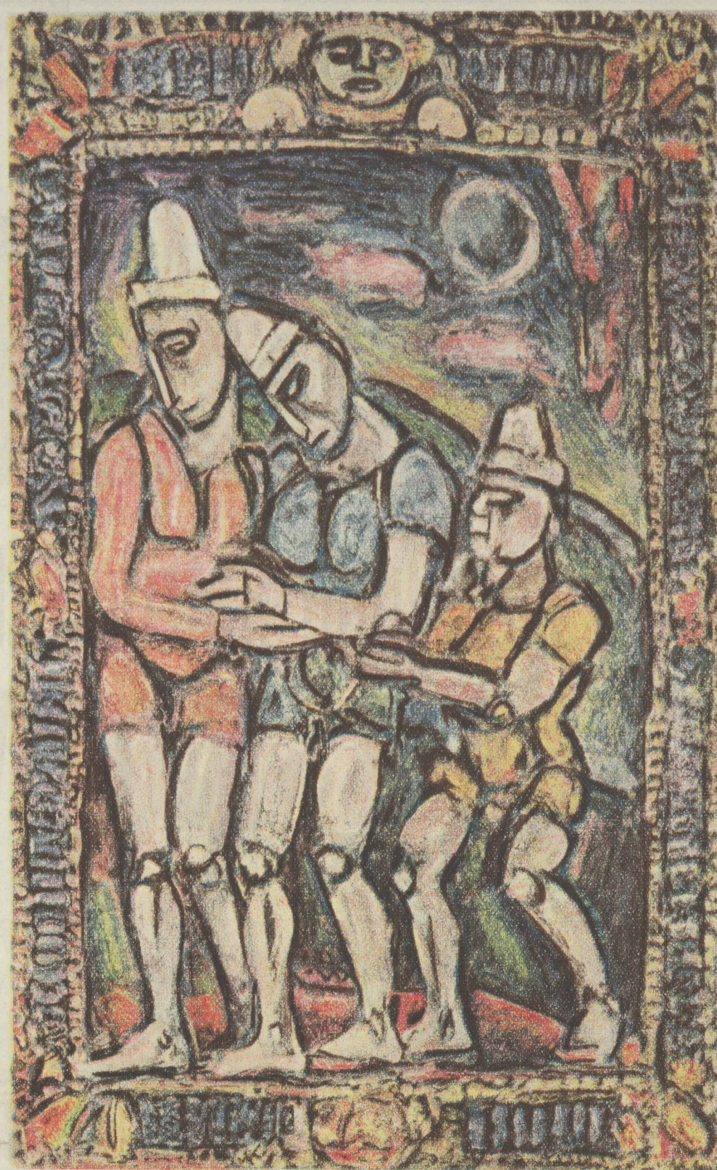
SORROW: Designed by Georges Rouault