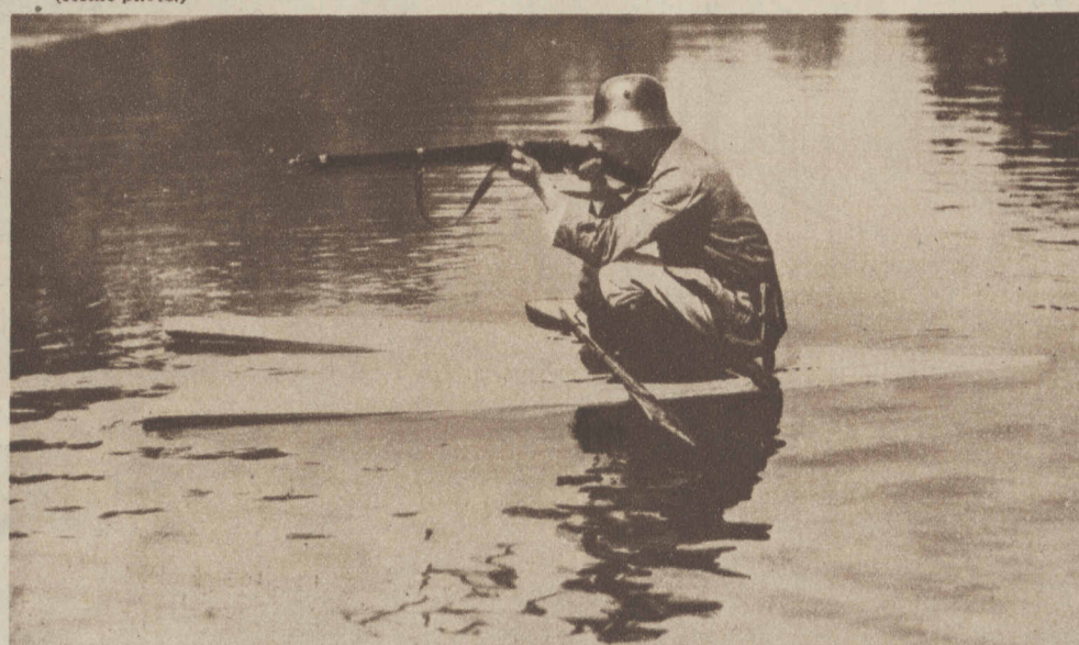
WATER SKIS JOIN THE AUSTRIAN INFANTRY—A soldier at rifle practice during tests of a new item of equipment. The "walking pontoons," it is expected, will be used for fording rivers where no bridges are available.