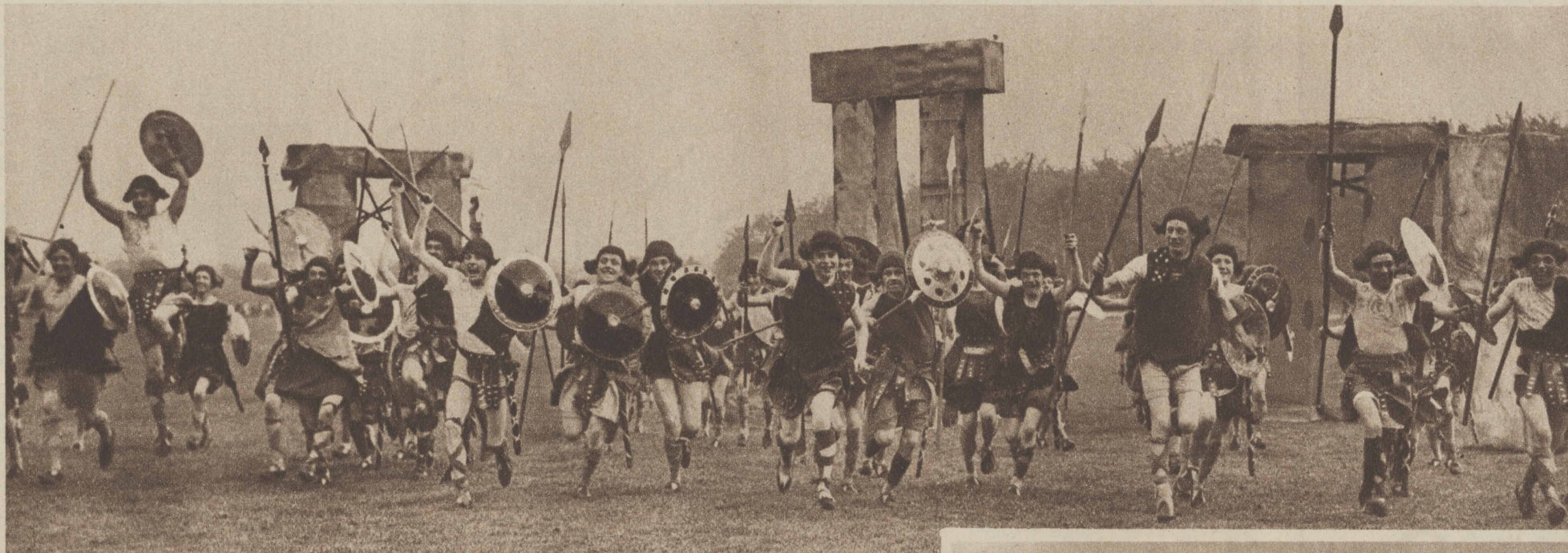
THE ROMANS INVADE BRITAIN AGAIN—And the native barbarians charge against the armored legions. The scene is from the famous military pageant produced annually at Aldershot.