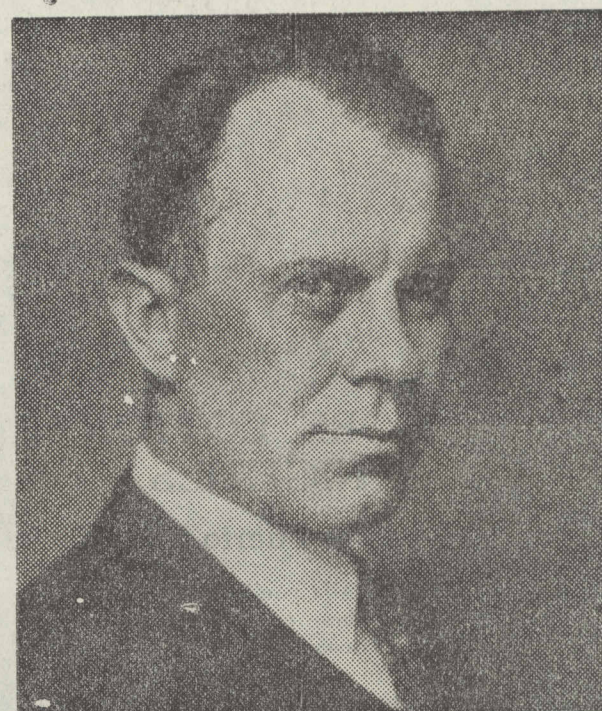
CAREY ORR Daily masterful drawings from the pen of this celebrated Tribune cartoonist will present the moods and spirit of the audience, the conflicts of delegations, and the fundamental issues at stake.