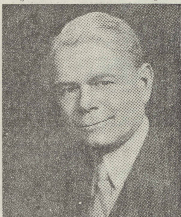
ARTHUR SEARS HENNING To get the full panorama of the convention and the significance of convention strategy, read the dispatches of Arthur Sears Henning, chief of the Tribune Washington bureau.