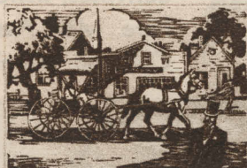
Brink's first money vehicle

LARGEST OPERATORS of ARMORED CARS in the WORLD