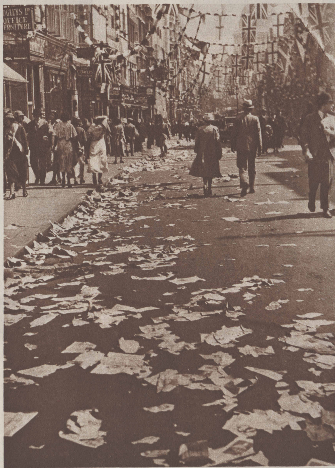
AFTER ENGLAND'S ROYAL JUBILEE PROCESSION—Typical debris in Fleet street.