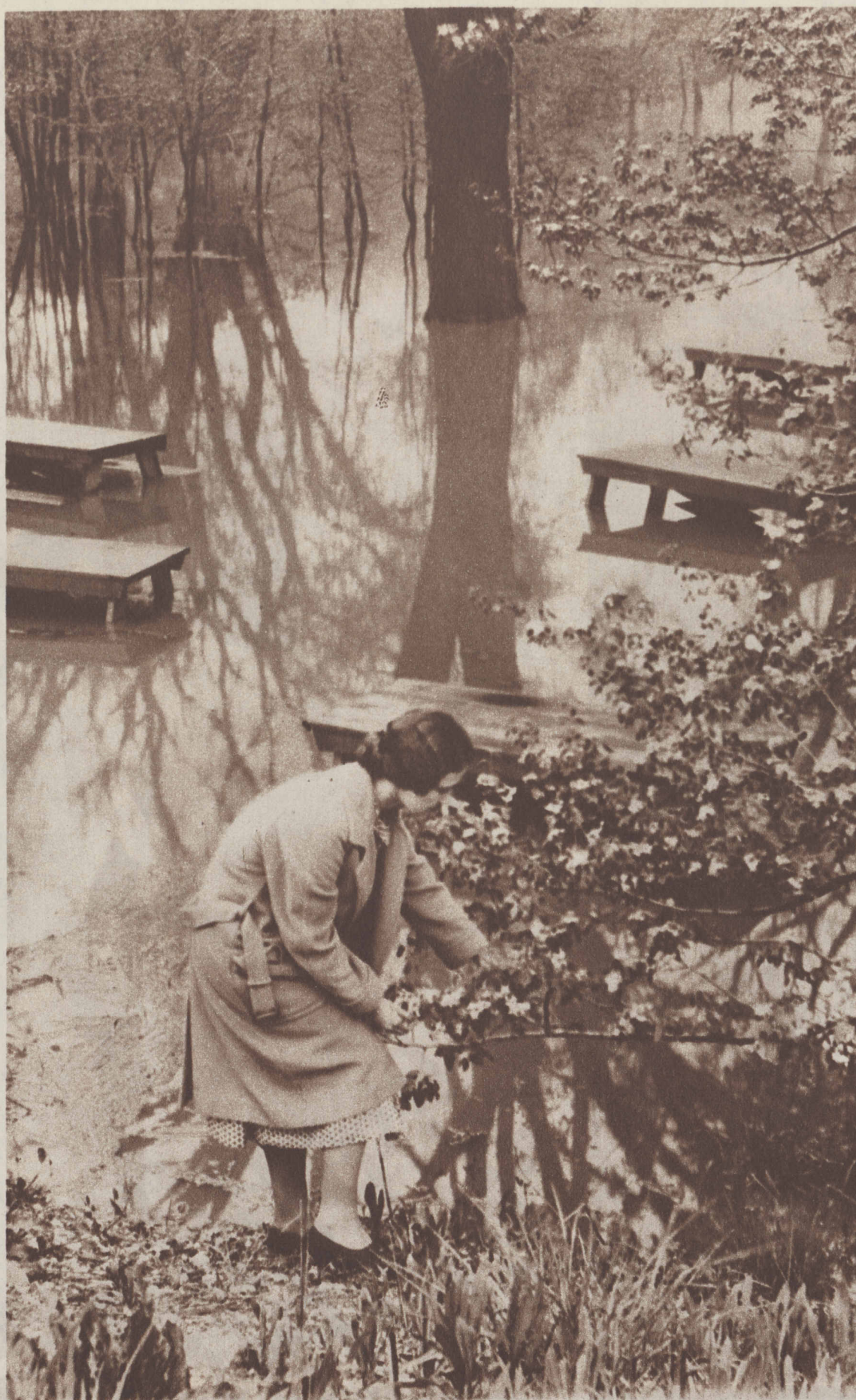
FLOOD IN THE FOREST PRESERVE—A submerged picnic ground near River Forest.

ON SANITARY NAPKINS, Mum will keep you from offending in this way.