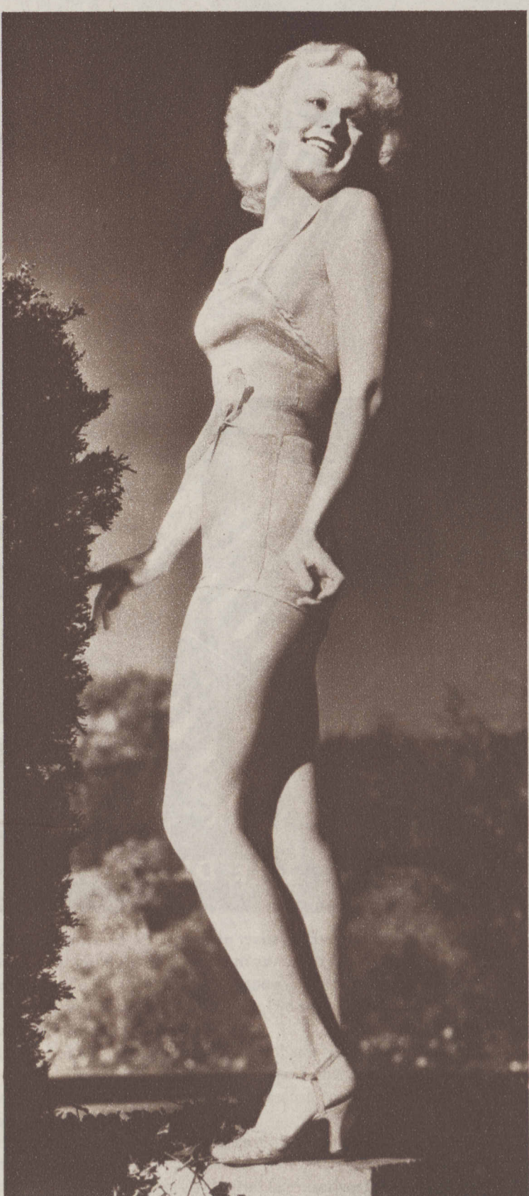
A CREATION OF WHITE in sea satin, which Jean may select when she tires of platinum, has low cut back, square front, and narrow shoulder straps. The belt ties at side in a propeller bow.