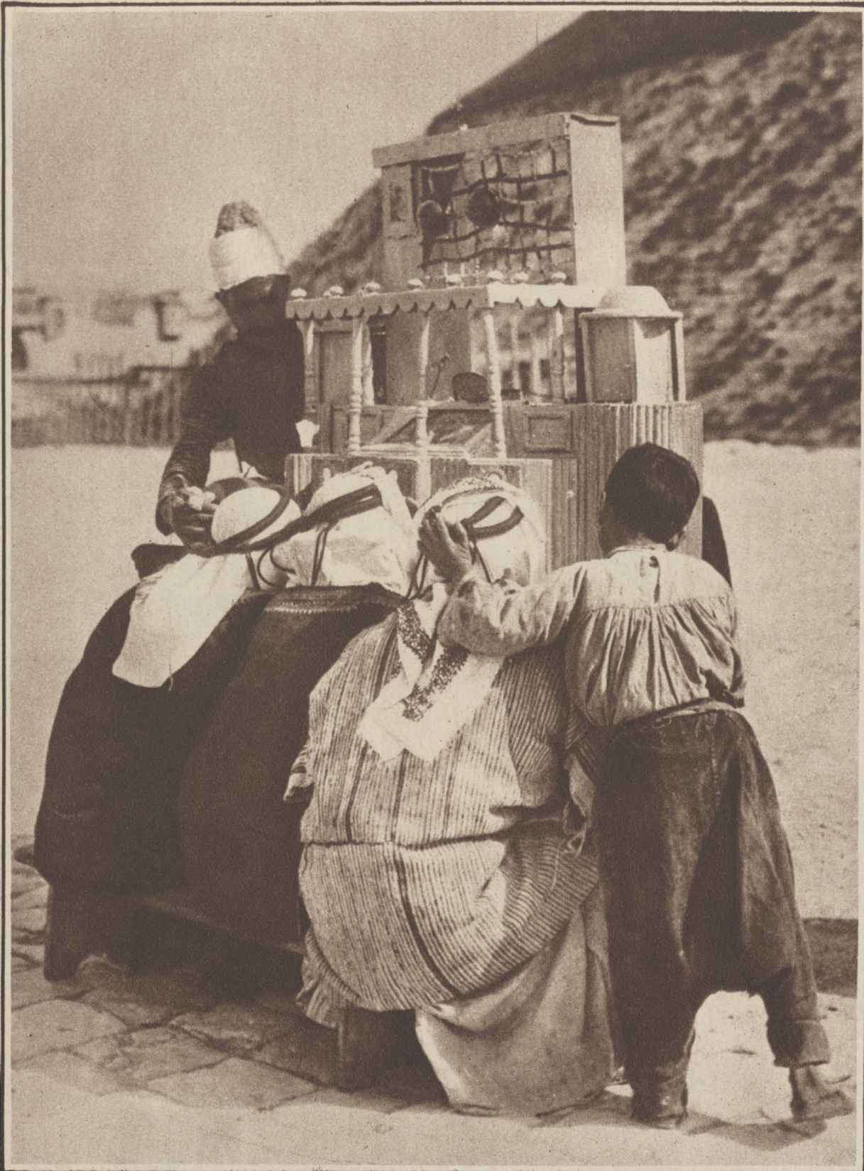
THE SHEIK (AS IS) ATTENDS THE "MOVIES" —Three of the Arabian nomads whose kind was glorified for American audiences are seen at a stereopticon show at Aleppo, Syria. The operator of the lantern slides and his youthful helper assist two of the audience who appear to be unaccustomed to this modern form of entertainment.